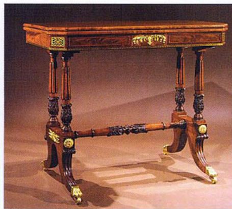
2 19th-century American card table, circa 1815, attributed to Thomas Seymour with carving possibly by Thomas Wightman