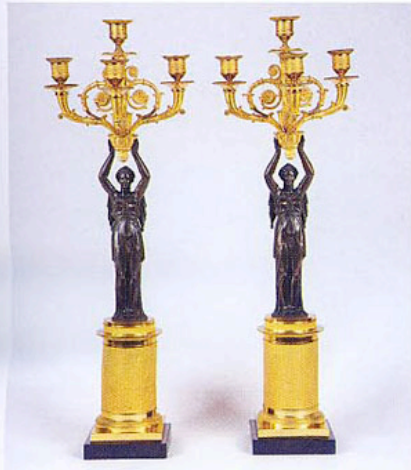
1 Pair of French Empire ormolu and patinated bronze four-light candelabra. Circa 1810. 27" h x 9" w x 7" d

DISTINCTIVE ART AND ANTIQUES, FROM ARCHITECTURAL DIGEST ADVERTISERS