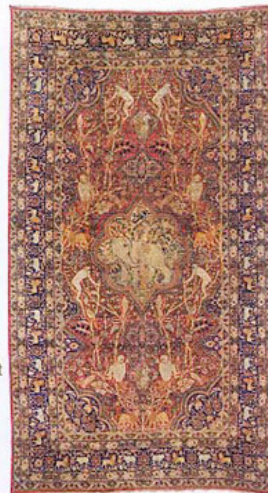
5 Lavar Kerman, circa 1880 rare Southeast Persian carpet influenced by the opulent exoticism of Safavid period designs. 16" h x 8'9" w