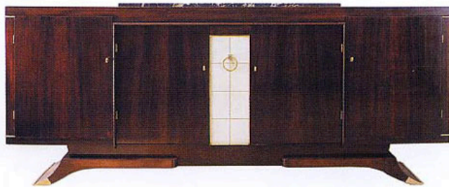
3 French Art Deco sideboard in the manner of Maxime Old. Rio palisandre with original parchment insert, portoro marble top and bronze hardware.