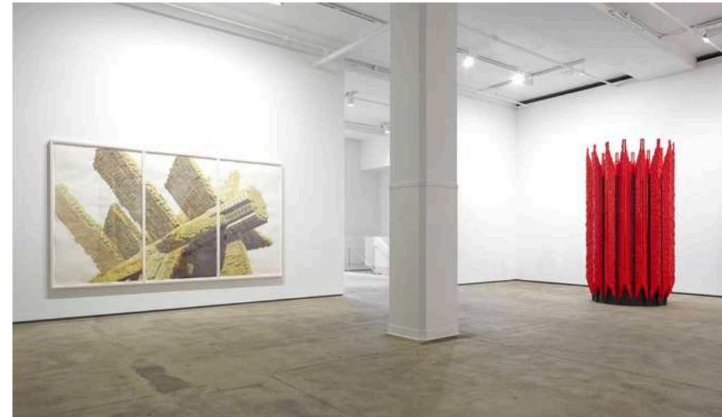
Installation view of the Los Carpinteros exhibition, Irreversible , at Sean Kelly Gallery

"The conga is an amazing tool to bring people together," says Castillo. "The Cuban Revolution used conga as a political rhythm; if you couldn't keep up, you were not a