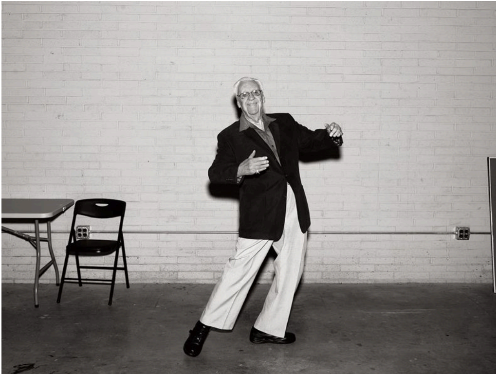
Bil. Sandusky, Ohio

Social media has become one of the leading ways we engage with life and feel connected to others, but the reality is, it's often surreal and lonely. Everywhere you look, people are staring at a small screen, liking, swiping, commenting, and "socializing" with people they can't actually see, let alone interact with. Photographer Alec Soth longed for a genuine, human connection, and took a series of road trips to search for signs of real-life community in America.