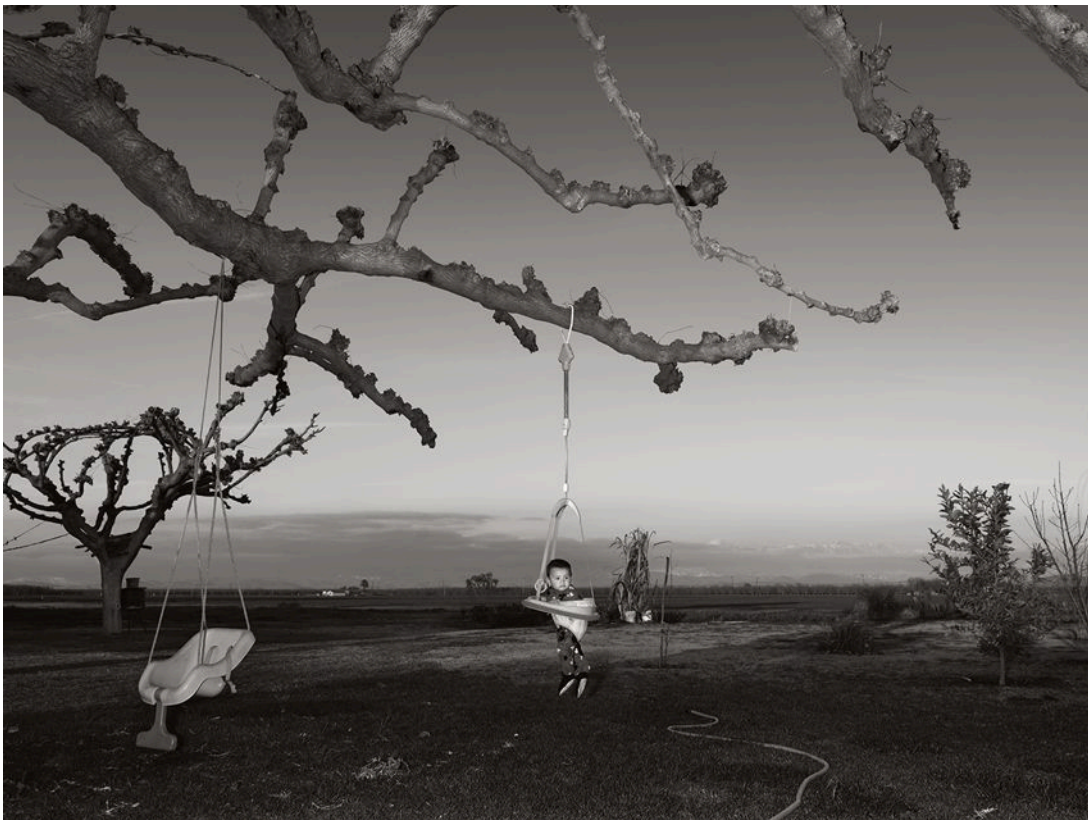
Woodville Farm Labor Camp. San Joaquin Valley, California