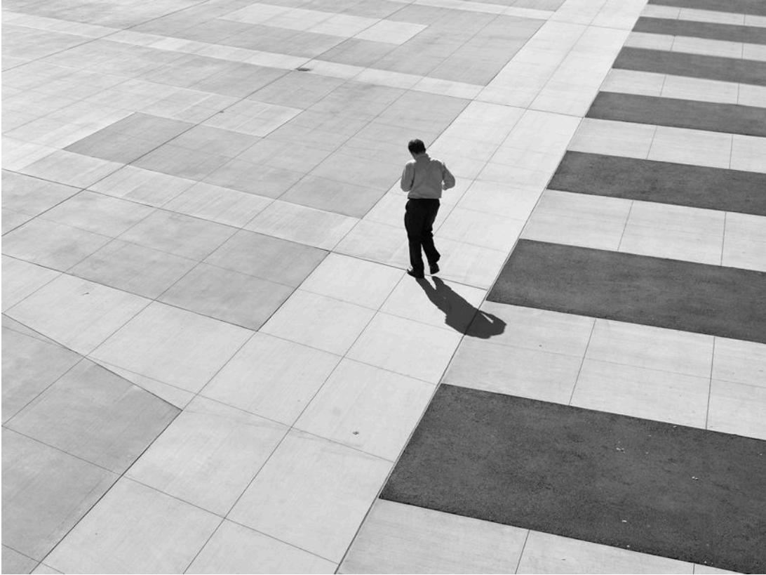
Facebook, Menlo Park, California ALEC SOTH. COURTESY FRAENKEL GALLERY, SAN FRANCISCO