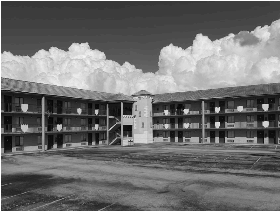
Magic Castle Inns and Suites, Kissimmee, Florida