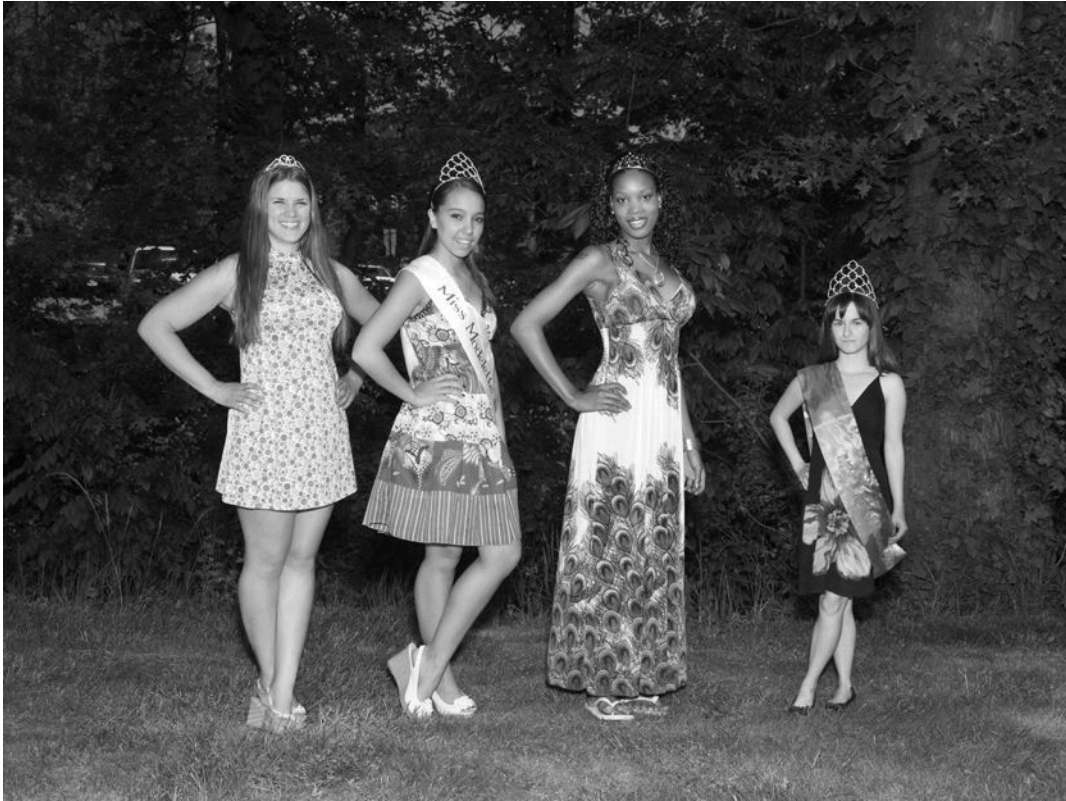
Miss Model Contestants. Cleveland, Ohio ALEC SOTH. COURTESY FRAENKEL GALLERY, SAN FRANCISCO