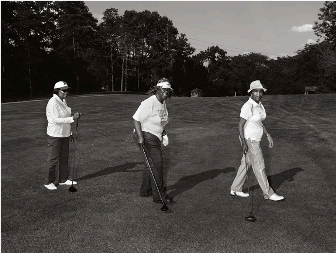
Madden Golf Club Women's Association. Dayton, Ohio