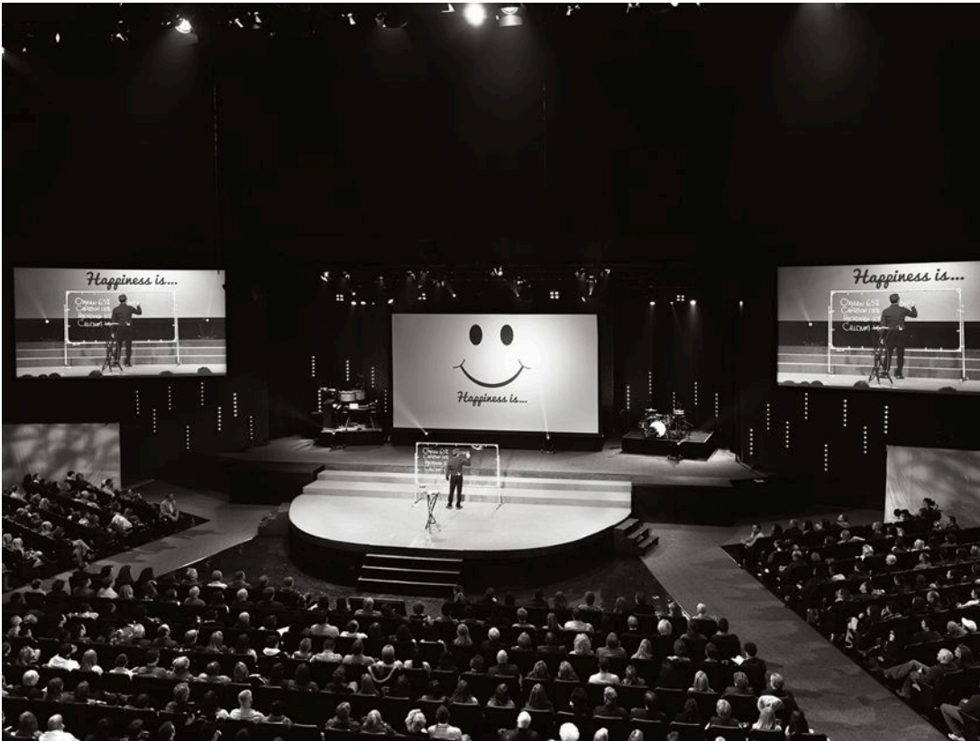
Fellowship Church. Grapevine, Texas