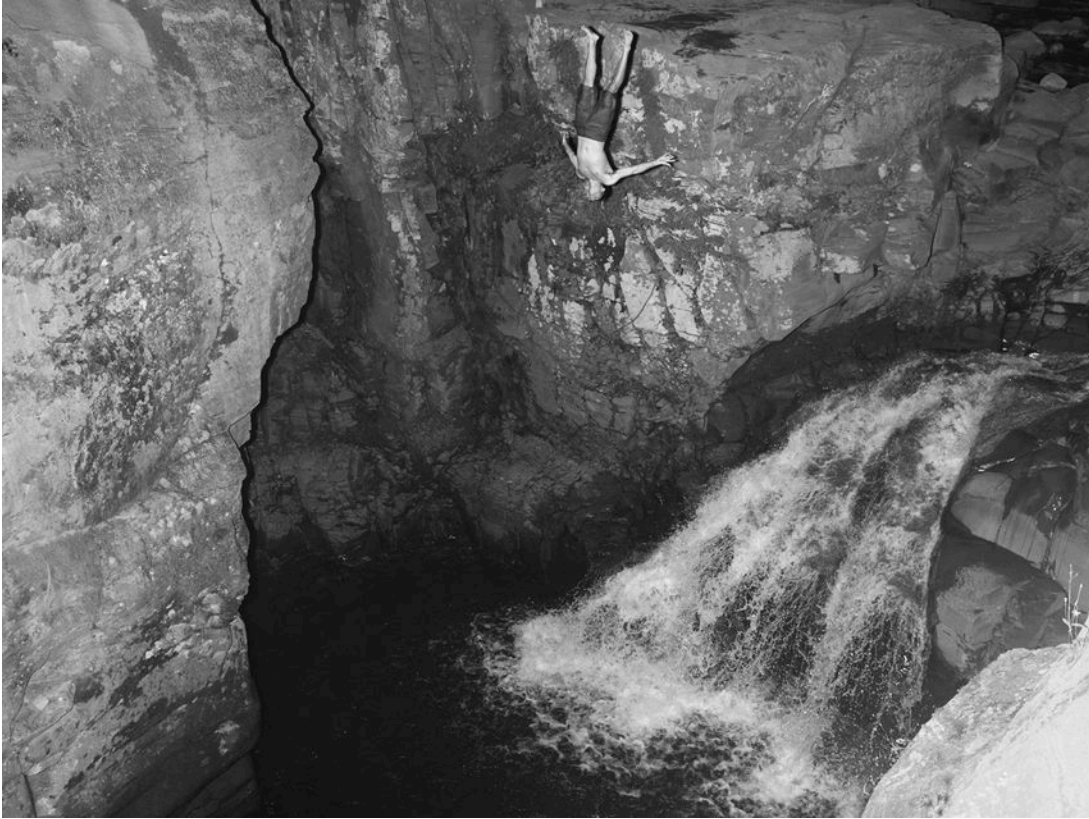
Near Kaaterskill Falls, New York