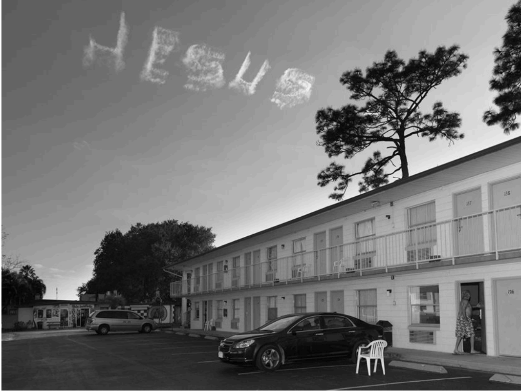
The Key Hotel. Kissimmee, Florida ALEC SOTH. COURTESY FRAENKEL GALLERY, SAN FRANCISCO