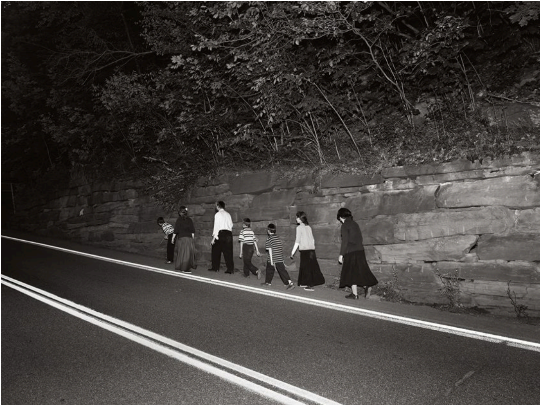
Kaaterskill Falls, New York