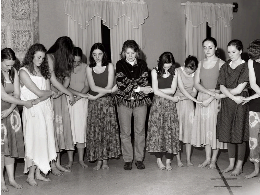
Children of Eden. Maplewood, Minnesota