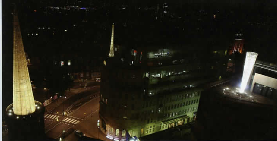
Above and detail: Breathing , 2005. Glass, stainless steel, and light, 10 meters high. Work installed at BBC House, London.

includes Blake in Gateshead (Baltic, England, 1996) and an even earlier commission made for Auch, France, in 1991. Each one is individually contextualized. At the Baltic Centre for Contemporary Art, for example, the work is set into a steel base carrying the words of the English poet, artist, and mystic William Blake. Yet all embody the apparent ambition of reaching for the heavens, of light restoring the earth's molten core to its origins in the distant depths of the universe. And in common with all of Plensa's public work, they are beacons for people, visual magnets that draw crowds and define a meeting point.