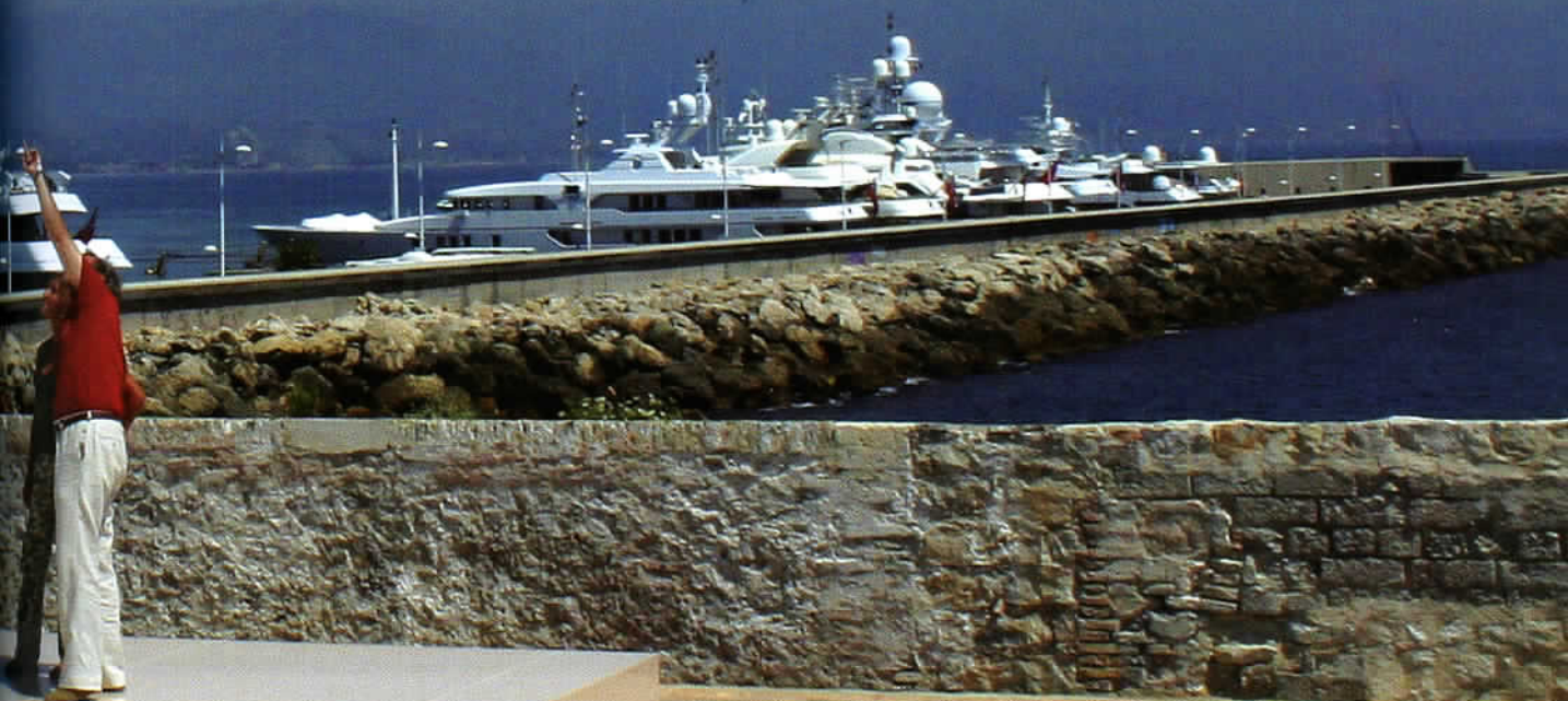
Nomade , 2007. Painted stainless steel, 800 x 550 x 530 cm. View of work installed in Miami Beach, Florida. Inset: I, you, she, or he... , 2006. Stainless steel and stone, 120 in. high. View of work installed at Frederik Meijer Gardens & Sculpture Park, Grand Rapids, Michigan.