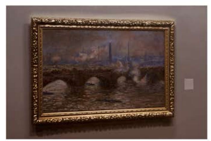
Images (left to right): Meta-Paintings 2, 2013. Oil on Multiple canvases, 90 x 135 inches; Untitled (Monet 3), 2014. oil on canvas,, 28 x 42 inches.

Individually, Klamen's smaller paintings read better from a variety of distances than his large pieces, which look best from afar and lose a bit of their magnetism when viewed up close. It isn't just because of size or detail; the smaller pictures seem to encompass more evidence of Klamen's own hand. Klamen is more concerned with the idea of representing each painting than with the ideas the original paintings themselves represented, so a certain degree of impassiveness is appropriate to the meaning of the work, but the content wouldn't suffer from a little more tactile subjectivity; in fact, it might be all the richer for it. He is, after all, a painter himself; if his personal voice were a little louder, it might better harmonize with that of the painters whose work he appropriates.