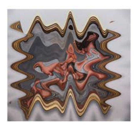
Images (left to right): Untitled (Van Gogh), 2014. Oil on canvas, 32 x 38 inches; Monet Remix, 2014. Oil on canvas, 34 x 48 inches; Mother and Child Remix, 2013. Oil on canvas, 70.5 x 77.5 inches.

The feeling is reminiscent of Thomas Struth's Museum Photographs, a series of photos of people looking at historic paintings in museums. In both artists' work, the viewer becomes hyper-aware of the act of viewing a painting thirdhand. Struth, however, works from the outside in with respect to the painting: he positions his viewer behind the viewers depicted in his photos. Klamen works from the inside out: in copying an artwork with his own hand, he positions himself between his viewer and the depicted painting. In Struth's photos, each painting is mediated by the camera and by the depicted viewers standing between the painting and the camera lens. Klamen's paintings are more spatiotemporally disorienting because they present the viewer directly with a picture in the same medium as the depicted artwork: the viewer has the rather uncomfortable feeling of being a participant in the painterly recontextualization, not just a bystander.