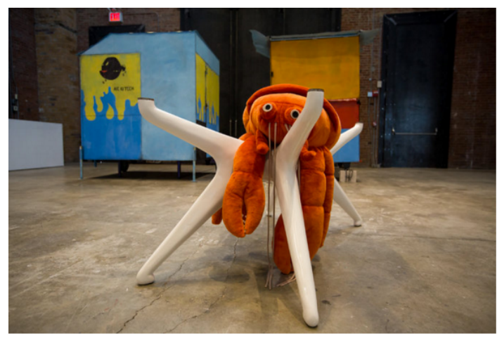
"The Bonin/Oswald Empire's Nothing #05," (2010) on display at Cosima von Bonin's show at SculptureCenter.

It's also a fitting counterpart to the Museum of Modern Art's current show of work by Kai Althoff, a friend of and