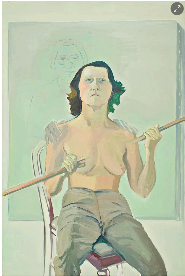
Self Portrait with Stick (1971)