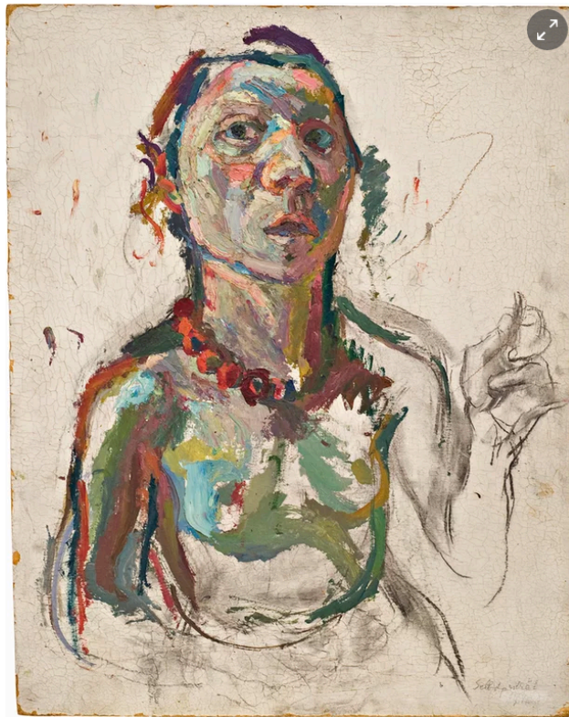
Expressive Self Portrait (1945)