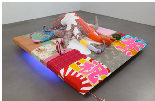
TOTAL PRODUCE (MORALITY) 2010 Various fabrics, foam materials, polyfill, rubber, wood, and neon tubes 86.61 x 86.61 x 23.62 inches

http://www.elephantmag.com/cosima-von-bonin-cvb-singles-uptown-remix-at-petzel-gallery/