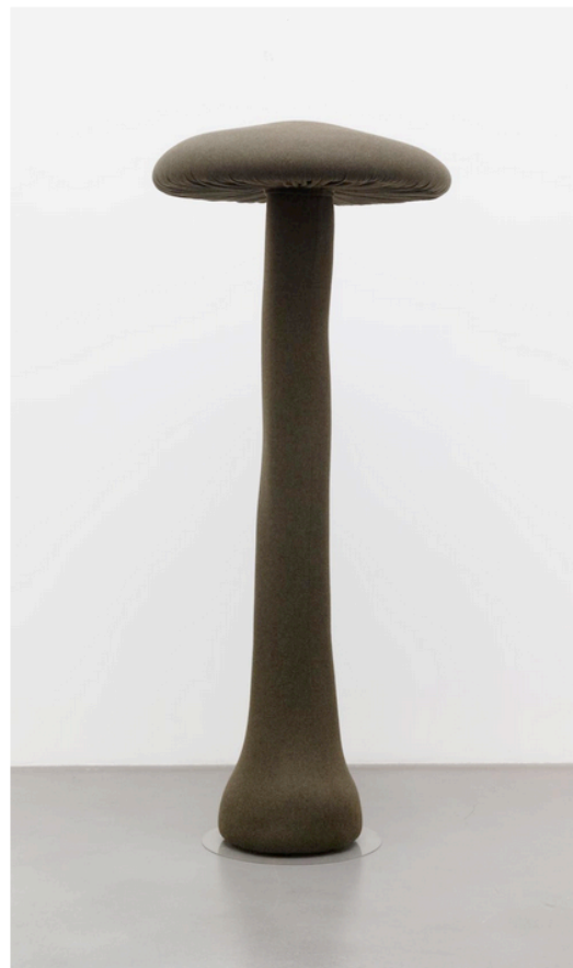
Ohne Titel (Pilz #78) 2004 Loden 70.87 x 29.53 inches