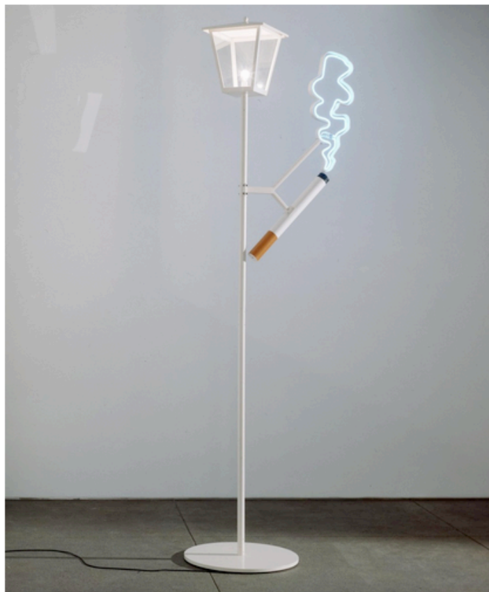
SMOKE 2008/2011 (CVB & MICHEL WUERTHLE) 2011 Steel, lacquer, plate-glass, spruce; SMOKE: Perspex, steel, lacquer, neon lamp, light-emitting diode 129.92 x 46 x 28 inches