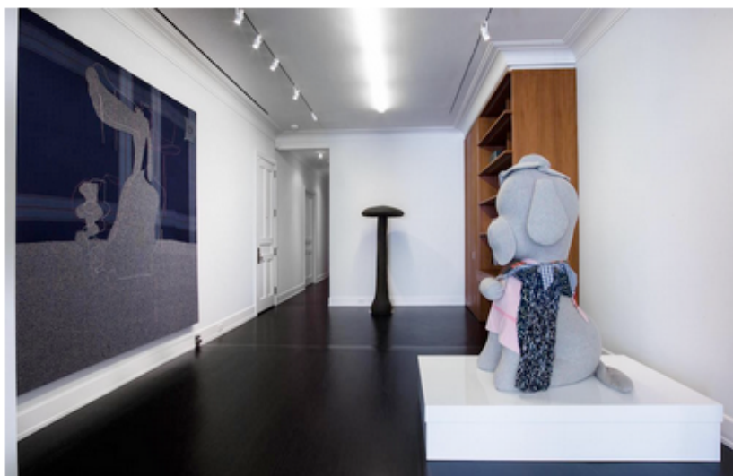
Cosima von Bonin CvB Singles Uptown Remix Installation view 7 2015

Cosima von Bonin: CvB Singles Uptown Remix is showing at Petzel Gallery until 31 October