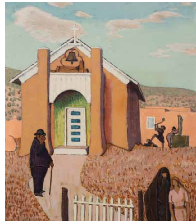
Ernest L. Blumenschein (1874-1960) Church at Placita , d.1938 gouache on paper, 11 1/4 x 9 3/4 inches