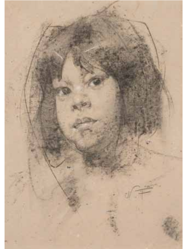
Nicolai Fechin (1881-1955) Mexican Girl , charcoal on paper, 14 3/8 x 10 3/4 inches