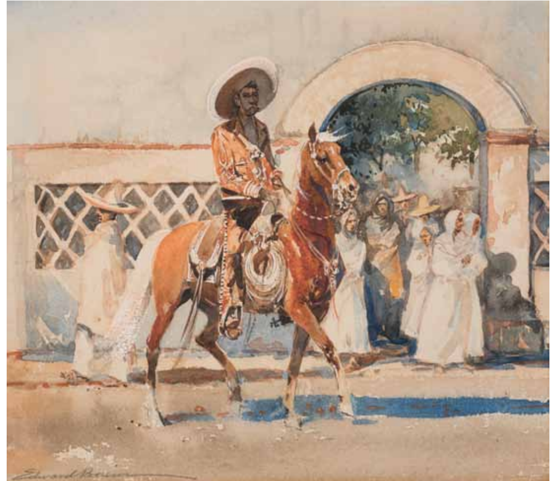
Edward Borein (1872-1945) Outside a Mexican Church , watercolor on paper, 8 3/4 x 10 inches