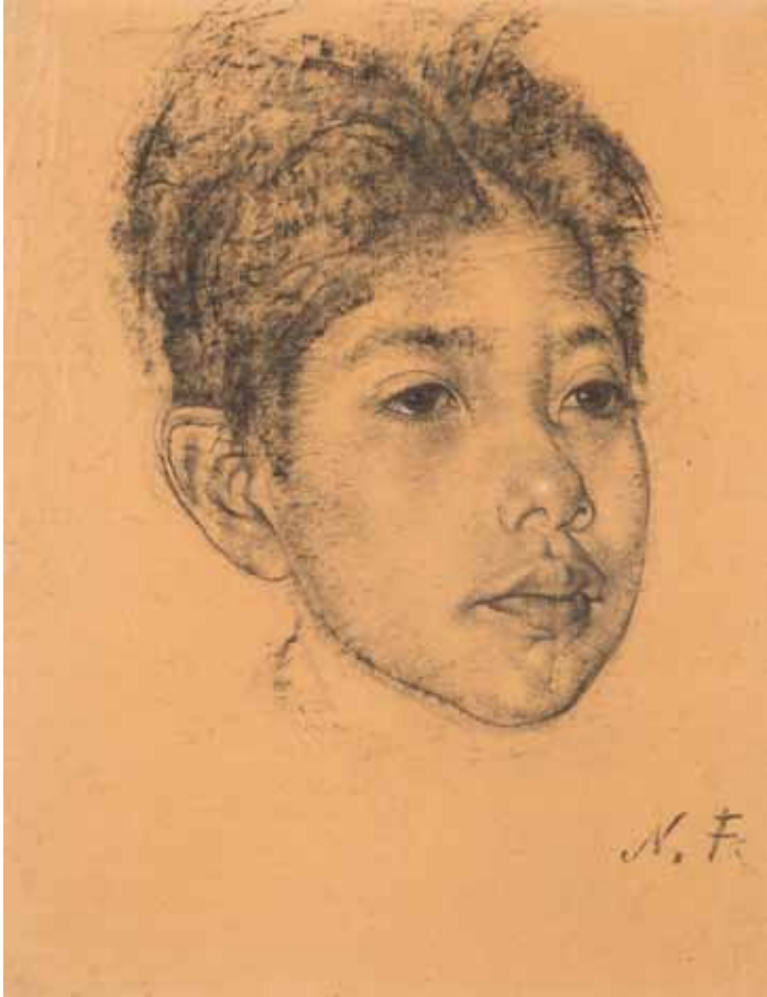
Nicolai Fechin (1881-1955) Young Boy , charcoal on paper, 14 3/8 x 11 3/8 inches