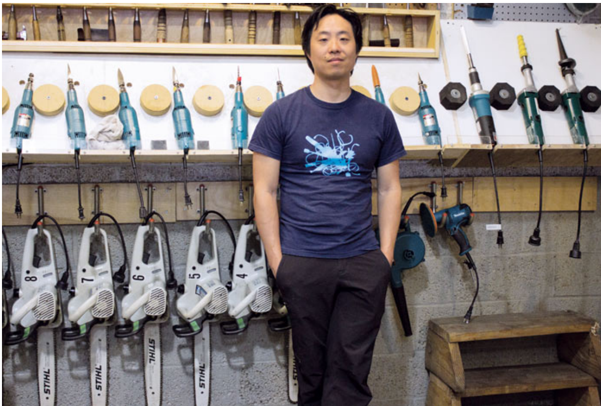
Article by Yvonne Lo

From custom ice cubes for cocktails to life-like sculptures to ice bars and ice wares to ice fashion, Okamoto studio brings ice to a design and production level in ways never imagined. Okamoto studio's ice is as clear and crystal as lake ice. The things they can do with ice have no limits.