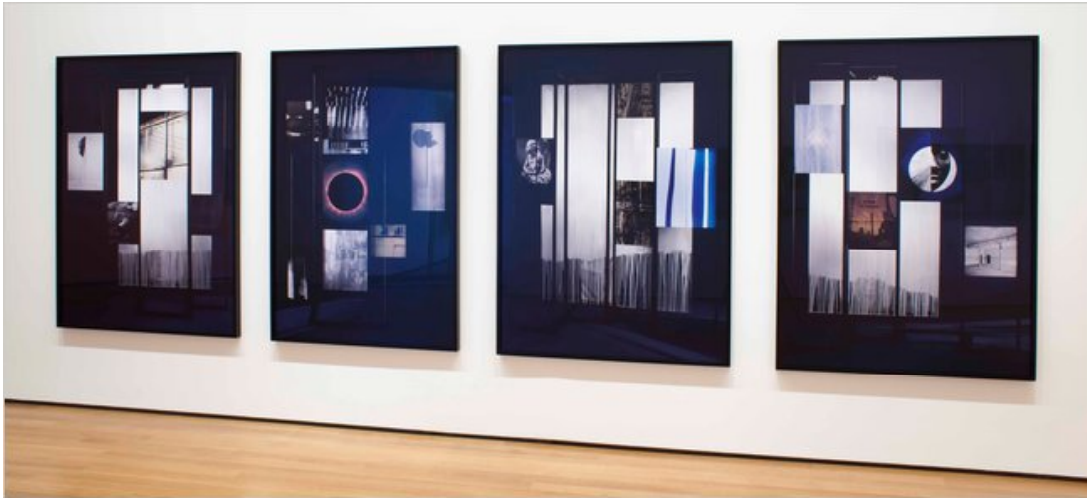
"A Composition for Detroit"