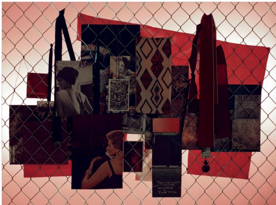
"A Reoccurring Pattern"