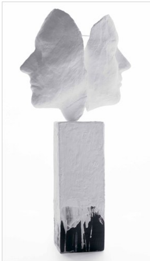
"We Will Become Silhouettes"

Others show architectural details, like the close-ups of decaying windows and foundations she encountered on a recent trip to New Orleans. And many of the most poignant found their source in Ms. VanDerBeek's childhood home in Baltimore, now up for sale. The show opens with "Blue Eclipse," a photograph of a photograph of the 1969 lunar eclipse that she discovered while cleaning out the basement, and closes with a grouping that includes an enigmatic image of light falling through the house's windows onto a wall.