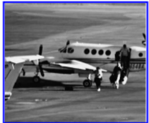
Paglen. Workers Gold Coast Terminal Las Vegas, NV Distance – 1 mile. 2007.

I take all of this as a starting point. In terms of my own aesthetic vocabulary, I tend towards images that manifest this dialectic. Images that 1) make a truth claim (“here’s X secret satellite moving through X constellation,” for example); 2) immediately and obviously contradict that truth claim (“your believing that this white streak against a starry backdrop is actually a secret satellite instead of a scratch on the film negative is a matter of belief”); 3) suggest a form of practice that could give rise to such an image (“if it’s true that this is a secret satellite, then there’s a whole lot more going on behind this image”); 4) suggest all of the above as an allegory for something about twenty-first-century images, knowledge, practice, aesthetics, and politics. Not all of the work I produce fits all of this—it’s just a loose way I use to think about what it is I’m doing.