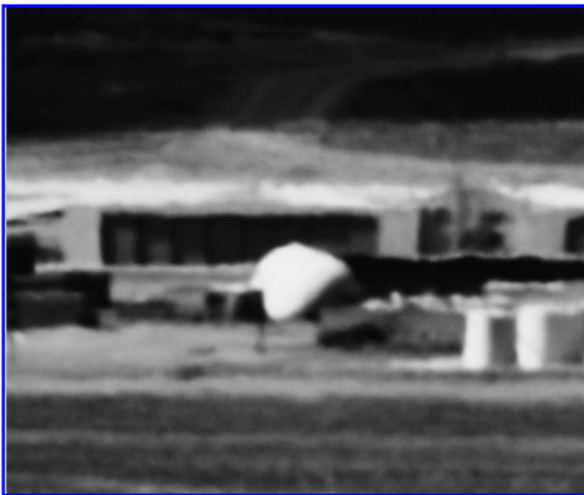
Paglen. Large Hangars and Fuel Storage; Tonopah Test Range, NV Distance ~ 18 miles, 10:44 a.m. 2005.

I have a second question. Conventionally, critics have looked at documentary photography and film and bemoaned their inadequacy as means of describing their subjects. But one consequence of the ubiquity of photo and video recording would seem to be that sometimes we get documents that are as adequate as one could reasonably want: the WikiLeaks video of the Apache helicopter murdering Iraqi civilians is a case in point. The document gives context, dialogue, and direct evidence of the slaughter, all of which allow the viewer to see not just the fact of the killings but the operation of the military mechanism that brought them about and the enjoyment of