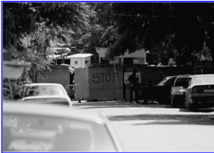
Paglen. Black Site: Kabul, Afghanistan. 2006.

But the overall question of the cultural politics of "viewing" art is something I just haven't spent that much time working out. I have a sense of what works for my own art, but don't really have a meta-theory of it. I'm much more interested in the cultural politics of producing art than the conditions of "consuming" it. I have long understood artworks as congealed social, political, and cultural relations, and that is what I'm interested in exploring. If I have anything to contribute to how we understand cultural production, it probably comes more from a "geographic" perspective than a traditional cultural-studies perspective. In a lot of my works, I try to set up various relations of seeing from which the artwork emerges. If I go out in the desert and spend a week photographing covert military operations, for example, it's quite likely that I'll ultimately end up with something quite formal or abstract looking. But the means by which I got to that particular abstraction are crucial to the work. They imply a politics of seeing and of relations of seeing and so forth. I think that there are tremendous and largely unexplored critical possibilities in this approach.