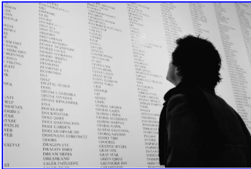
Pages. Code Names. c. 2001-.