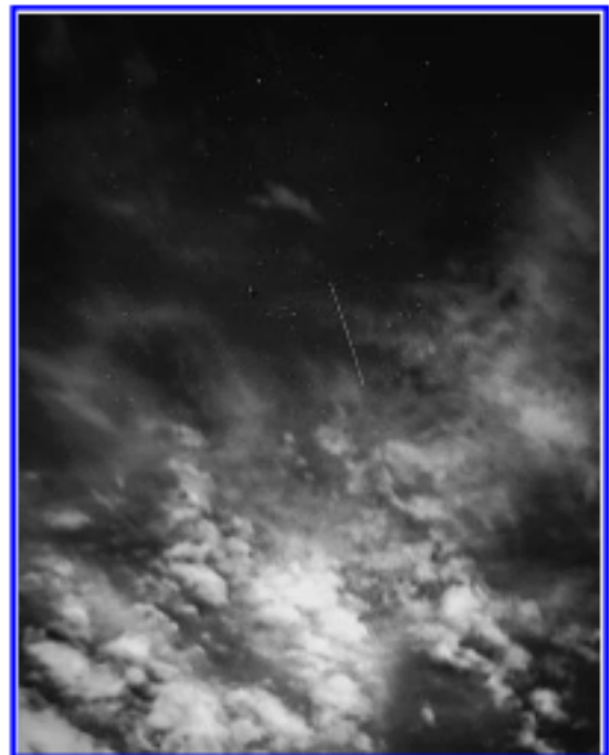
Paglen. Keyhole 12-3/Improved Crystal Optical Reconnaissance Satellite Near Scorpio (USA-129). 2007.

I have a second question. Conventionally, critics have looked at documentary photography and film and bemoaned their inadequacy as means of describing their subjects. But one consequence of the ubiquity of photo and video recording would seem to be that sometimes we get documents that are as adequate as one could reasonably want: the WikiLeaks video of the Apache helicopter murdering Iraqi civilians is a case in point. The document gives context, dialogue, and direct evidence of the slaughter, all of which allow the viewer to see not just the fact of the killings but the operation of the military mechanism that brought them about and the enjoyment of