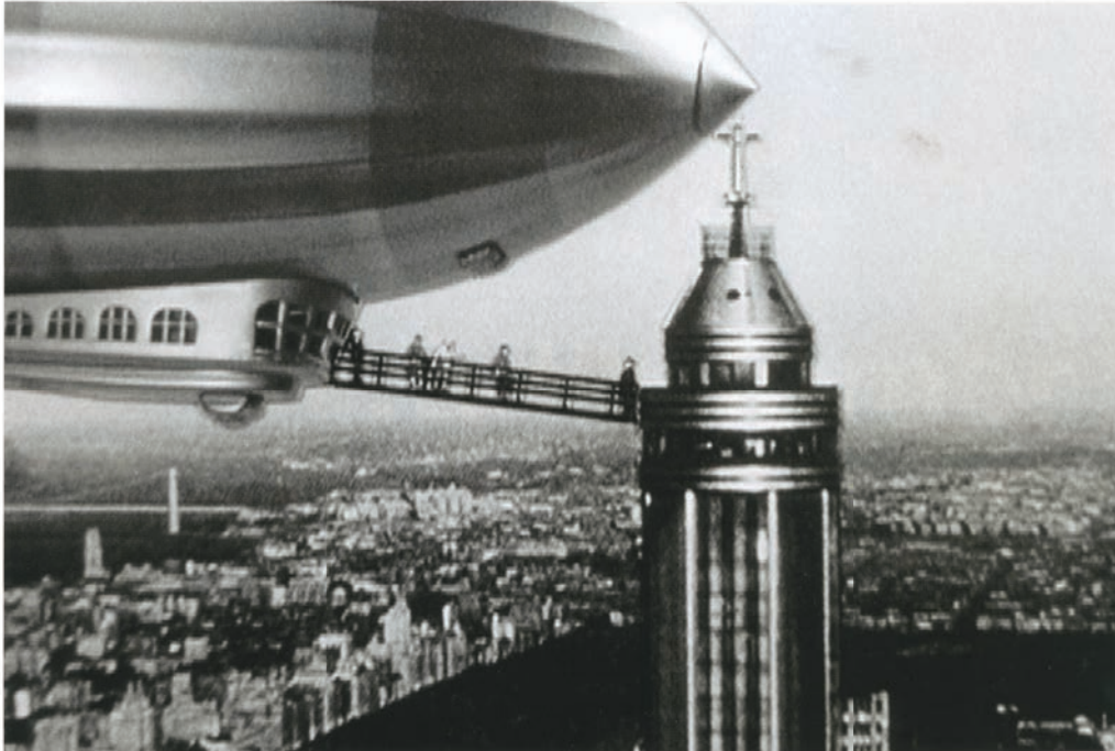
Detail of a stop-action animation still from T. J. Wilcox's 10-channel video installation In the Air , 2013.