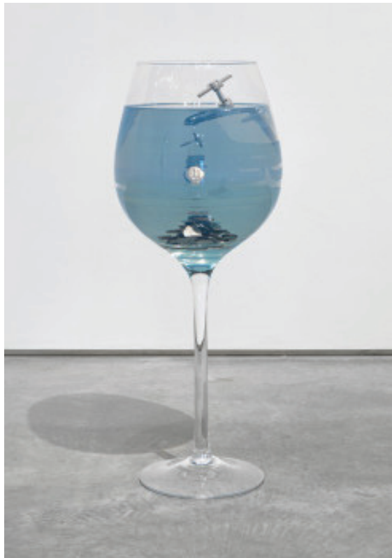
Nina Beier, Plunge, 2015, faucet, coins, resin, wine glass, 29 1/4 x 9 1/2 x 9 1/2 inches. COURTESY THE ARTIST AND METRO PICTURES GALLERY