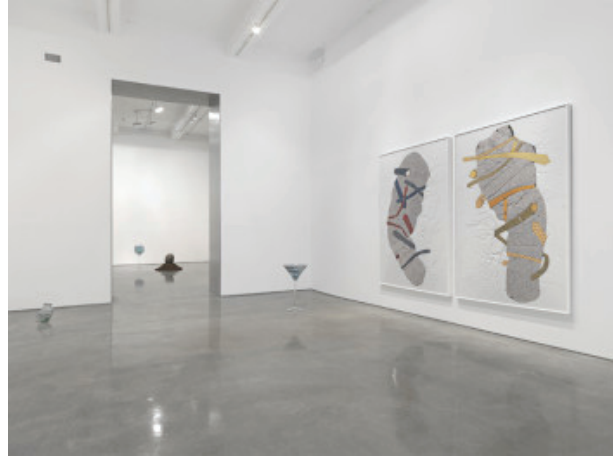
Installation view of Nina Beier at Metro Pictures, New York.

“These author-less and homeless images found in image banks spring from freelance photographers trying to figure out what others might want to communicate or might need to be said today,” Beier said. “Empty and open metaphors are created, and the less these images mean, or to put it differently, the more these images mean, the more successful they are.”