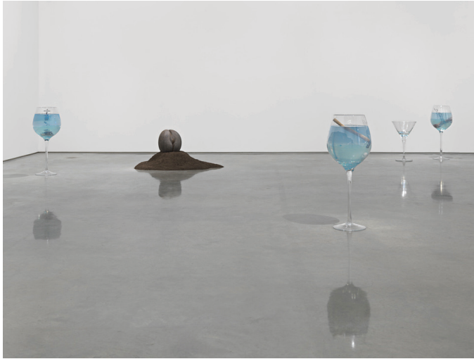
Installation view of Nina Beiers at Metro Pictures, New York.

an impressive pile of Hermès ties and a curvaceous, dark brown coco fesse seed from Seychelles, which measured about a foot long. (I highly recommend looking at pictures of them for a bit; they are incredible objects.)