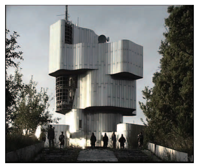
Scene for New Heritage, 2004

peripheral, the collages offset the encapsulated time and the enclosure of bound artifacts or fetishized art objects implied by the museological display structure and immediately recognizable Minimalist trope. A montage-like sequence of black-and-white photographic fragments are partially draped and offset by swaths of multi-colored, cotton cloth obstructing and adorning each canvas; partial gestures, the photographic fragments show hands placed protectively downward, a facial gesture obscured to reveal only the blank geometry of tie and blazer, more hands clasped in an embrace, arms crossed in observation, or a woman in bureaucratic attire visible from behind.