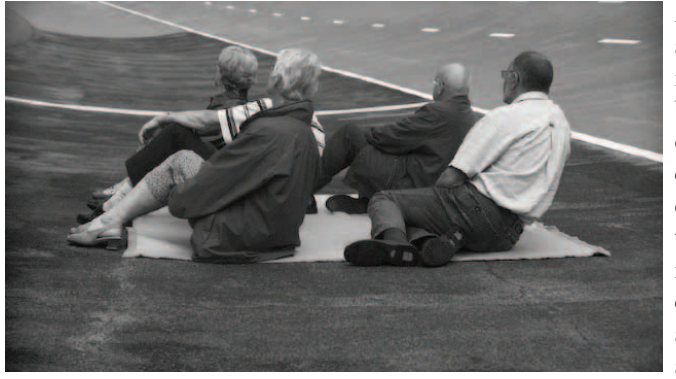
Out of Projection, 2009

Meade, Fionn. "David Maljkovic, Abundant Motives," Metropolis M (September 2012).