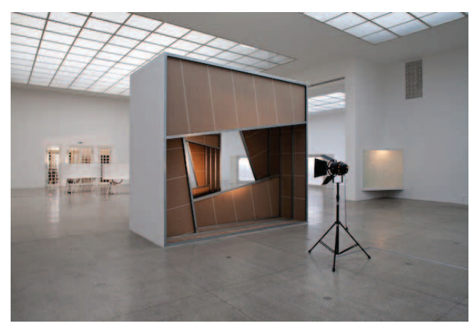
Exhibitions for Secession, 2011, at Secession, in Vienna