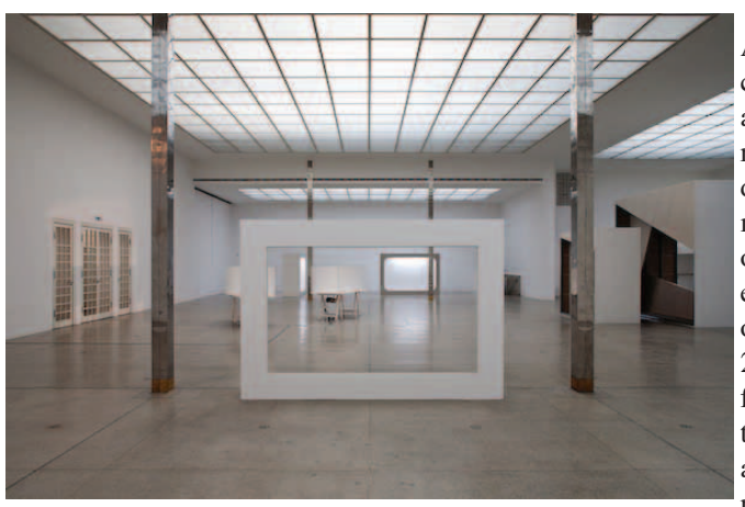
Exhibitions for Secession, 2011, at Secession, in Vienna