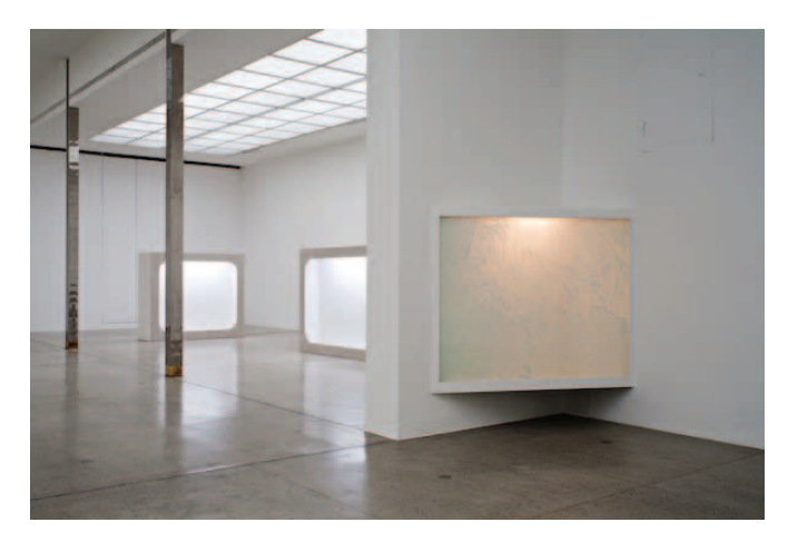
Exhibitions for Secession, 2011, at Secession, in Vienna