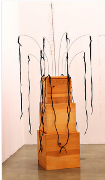
"Untitled, 2001," includes shoe buttons and laces

Again and again, Mr. Wurtz's work invites us to think about what we look at, and moreover what we look for, when we look at art. Then it gives us something slightly different, something equally visual, gratifying and, above all, charged with the deliberation and focus that are the essence of art.