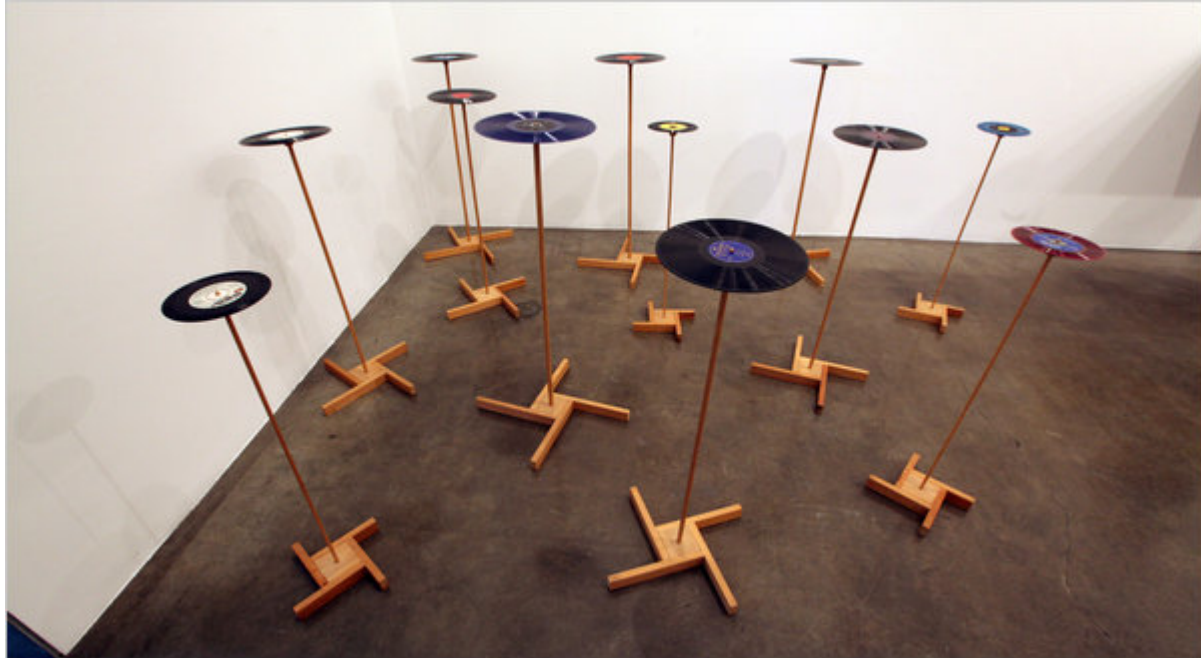
B. Wurtz's "Untitled, 1981" includes old records and wooden dowels.

The less-is-more tradition in American art is rich and varied. It stretches from the glorious frugalities of Shaker furniture and Amish quilts to the sleek orthodox Minimalism of Donald Judd's box sculptures and Agnes Martin's horizontal-stripe paintings. And it also accommodates the modest, plain-spoken sculptures and wall pieces of the artist B. Wurtz.