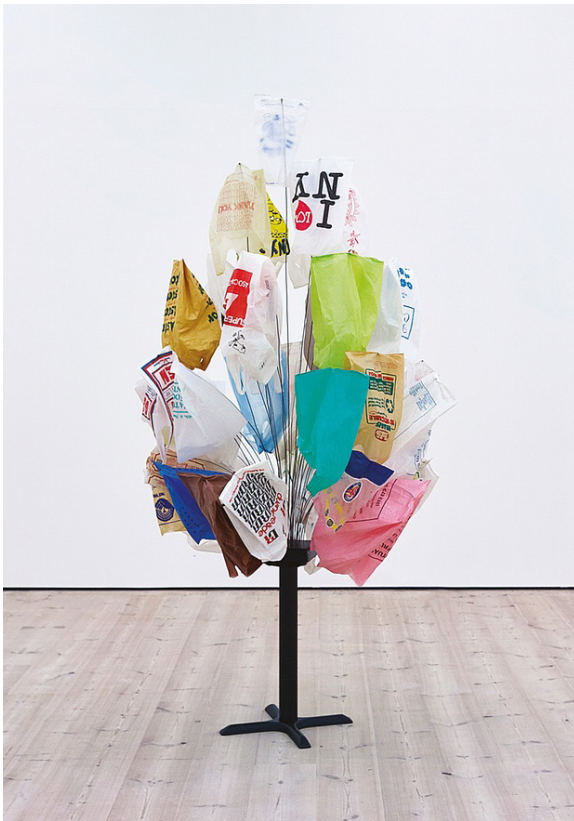
One of Wurtz's carrier bag trees 'that billow into bloom on the gallery air'.

paintings in some contemporary blue-chip gallery. This is not necessarily much of a thrill in itself, any more than the original cartons, which remain dumbly recognisable.