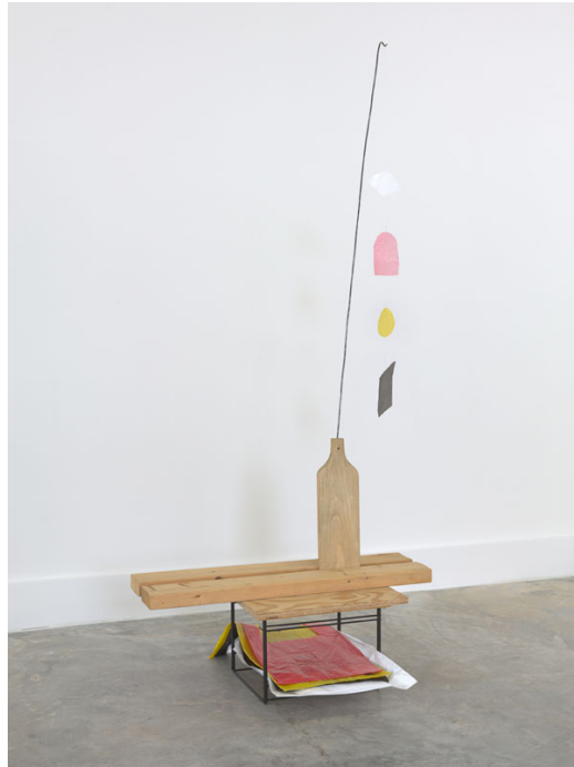
B. Wurtz, Untitled , 1997. Wood, wire, metal, plastic bags. 67 × 30 × 21 inches.

Wurtz: I've discovered that the ones that work for me are the ones that are very ordinary and probably overlooked. It fits right in with the food, clothing, and shelter thing. I realized that objects that had too many interesting things going on already didn't leave any room for me. They were already amazing things in themselves and it was going to be no fun for me to make them become something else. With overlooked objects it's sort of like my little challenge to see if I can get somebody to look at them more carefully. But they're also neutral enough that they can start to function as just a formal element—a shape, a line, a color—and I want to expand upon that to build something that becomes a little more complex formally. I'm not interested in obscuring what the objects are and what their actual use is and I'm not interested in piling thousands of them together so that you don't see them anymore and it becomes something else. In a way it's like respecting them. I'm paraphrasing Richard Tuttle, who made a great comment talking about the sort of lowly, junky thing. He said that if you give it respect it will give it back to you.