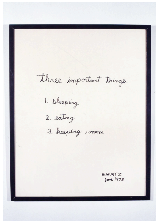
B. Wurtz, Three Important Things , 1973. Ink on paper. 29 1/2 × 23 3/4 inches.

Wurtz: Are you talking about shocking the bourgeoisie?