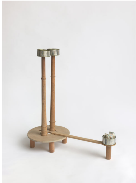
B. Wurtz, Untitled (cans with pier) , 1989. Wood, tin, cans, cloth. 26 1/4 × 25 1/4 × 12 inches.