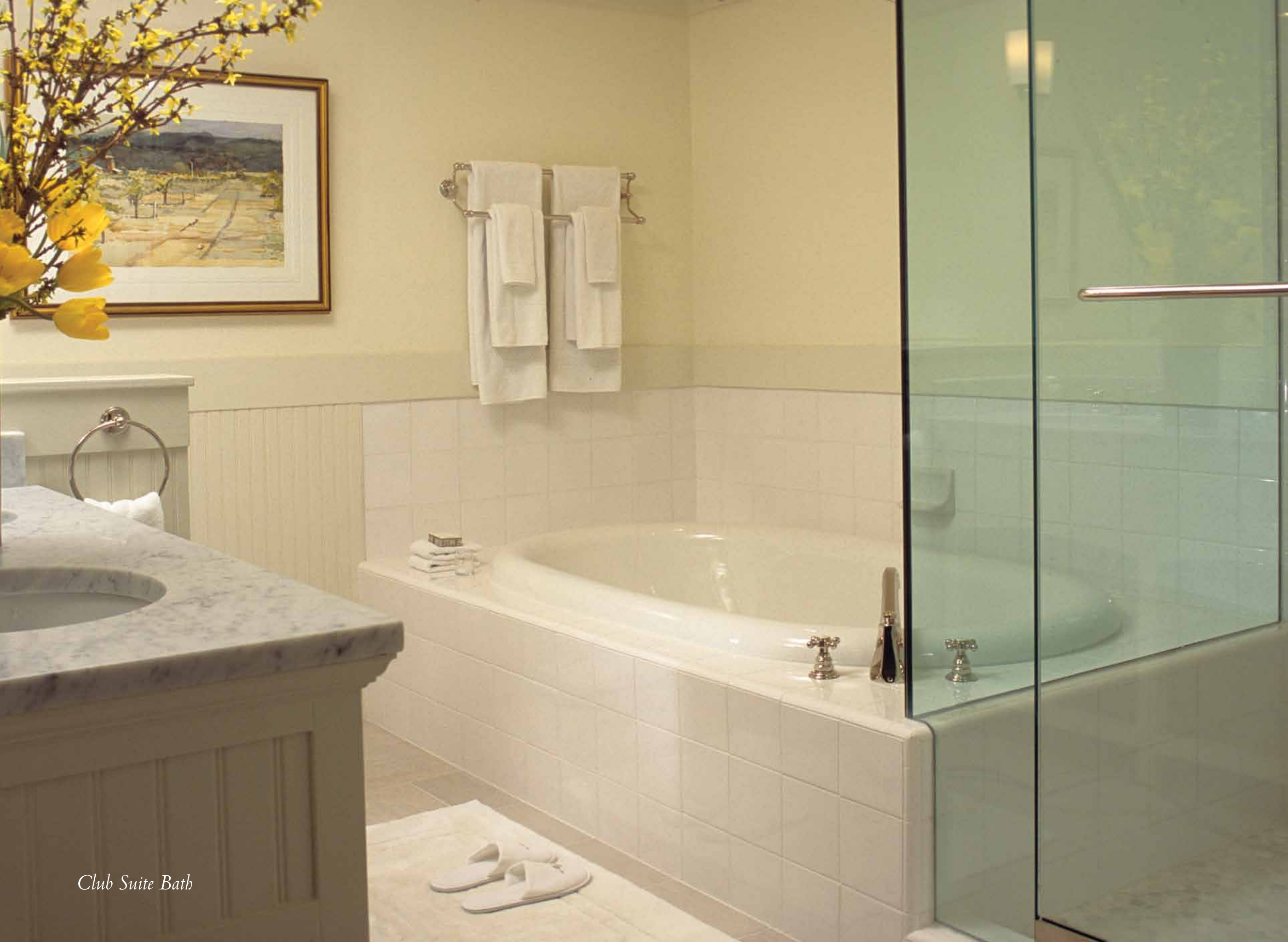
Club Suite Bath