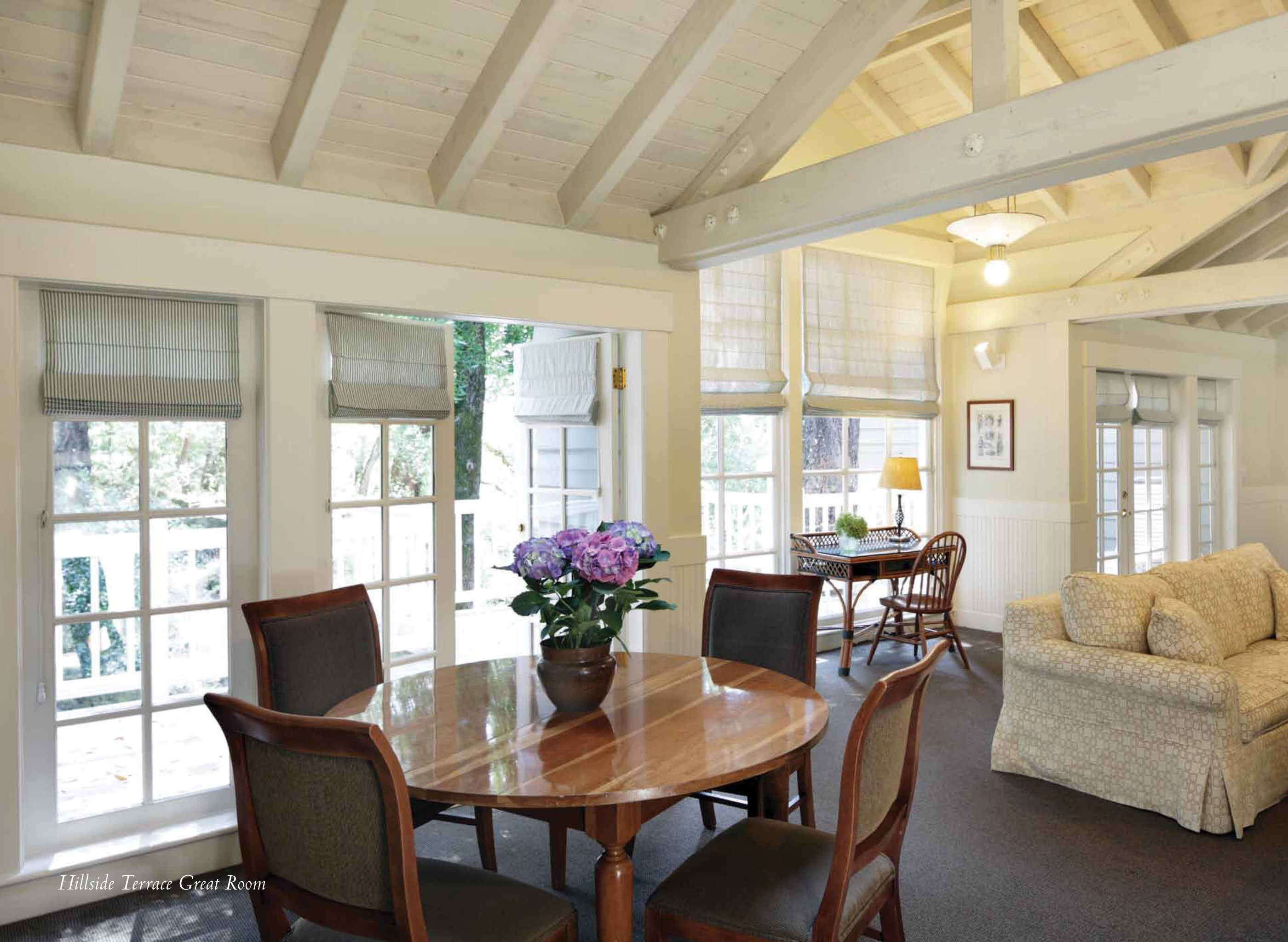
Hillside Terrace Great Room