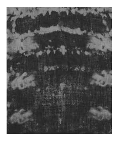
Evan Nesbit, "Porosity (Bay Leaves and Sandalwood Study)," 2014, acrylic on burlap, 44 \times 36", is currently on view at Roberts & Tilton.

"GRFAWKV" (an invented word) is the title of Christopher Russell's ambitious and impressive exhibition that includes a hand bound artist's book as well as numerous scratched photographs. Each of the photographs are of lens flare — the bright spots that appear when the camera is pointed toward the sun — turning the original image