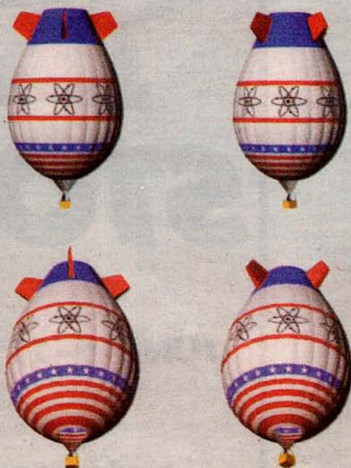
Designs for Person's hot air balloon in the shape of a stylized atomic bomb

Chad Person is soliciting funds for the construction of Fugo II through the website buildthebomb.com , which also includes more fascinating details about the project.