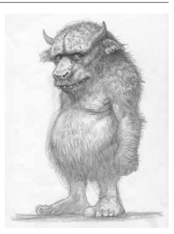
Maurice Sendak, sketch of "The Bull" from "Where the Wild Things Are", is currently on view at Bowers Museum.

The centerpiece of "Maurice Sendak: 50 Years • 50 Works • 50 Reasons" is a video first created by Prague animators in the 60s and 70s, with narration and music by Peter Schicklee (aka, PDQ Bach) added in the 80s. Based on the Sendak books, "Where the Wild Things Are" (published 50 years ago) and "In the Night Kitchen," this little film faithfully follows the author's drawings and intentions, bringing Max and Mickey respectively to life. The "Wild Things' scenes following "'And now,' cried Max, 'let the wild rumpus start!"" are especially compelling, with only soft jungle music accompanying the characters - dancing in the moonlight, hanging from the trees and prancing around with Max on their backs. Seeing these once static characters brought to life recalls Pinocchio becoming a boy in the Disney cartoon. The exhibition also includes several drawings and etchings by Sendak depicting "Wild Thing" characters and props, a bronze sculpture of Max and the Sea Monster,