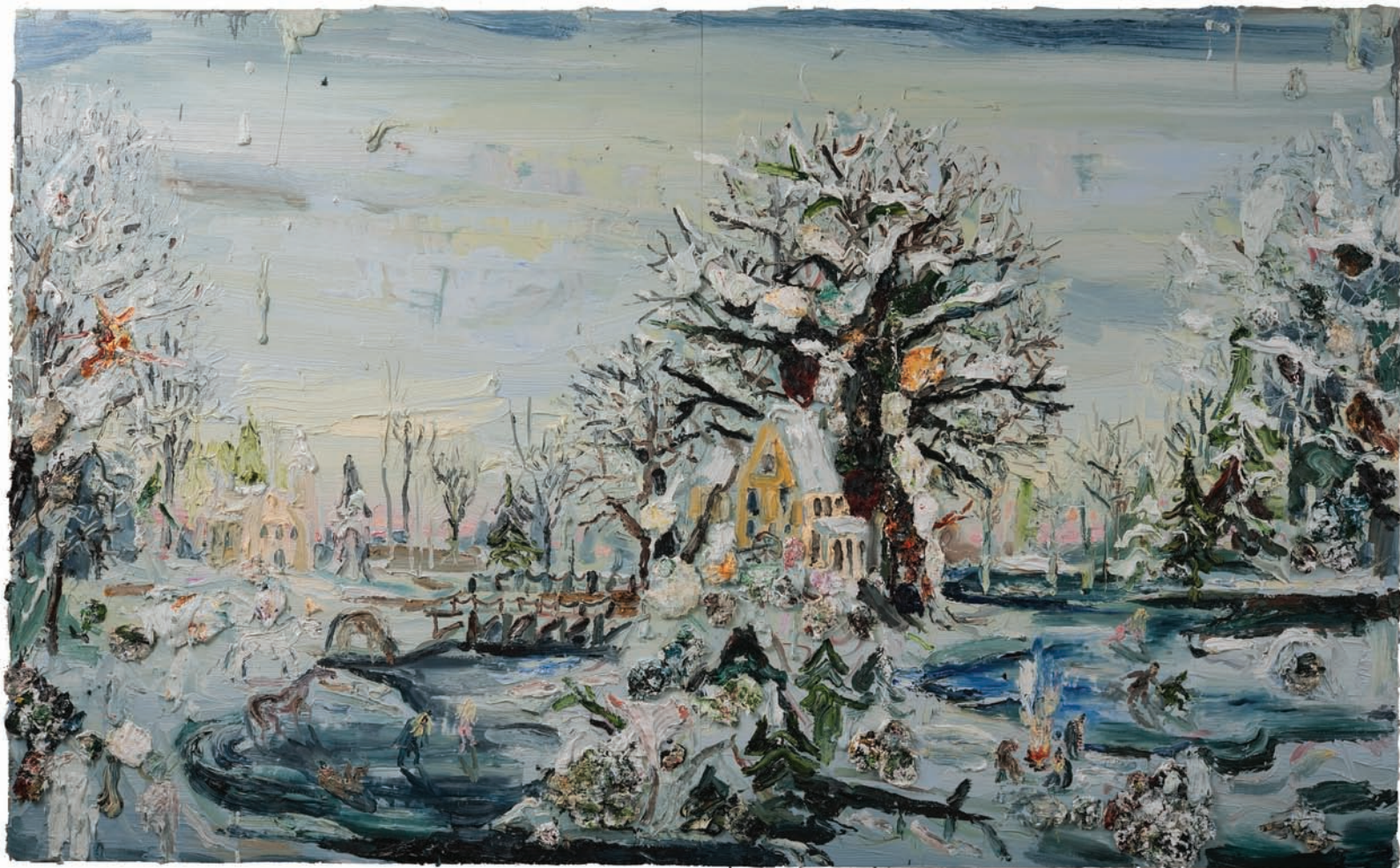
Home for Hobo , 2009. Oil on linen, 84 x 136 inches