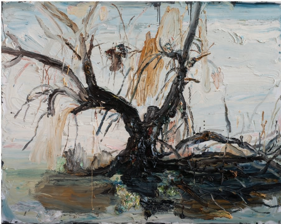
Desert Tree, 2010. Oil on linen, 78 x 98 inches

"In Terrains Vagues , the colors are subdued, the paint is less dense, and the brushstrokes are flatter and more refined. Against a grey-washed background, a fairly detailed set of objects and shapes is arranged in a precarious stack that references Duchamp's famous staircase. In this painting, Smith exhibits the most control over her brushwork and a stronger formalism in her composition to great effect..."