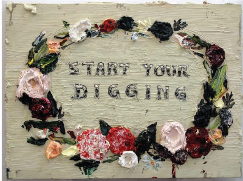
Above: Song Painting #4 (Start Your Digging) , 2009. Oil on linen, 30 x 40 inches