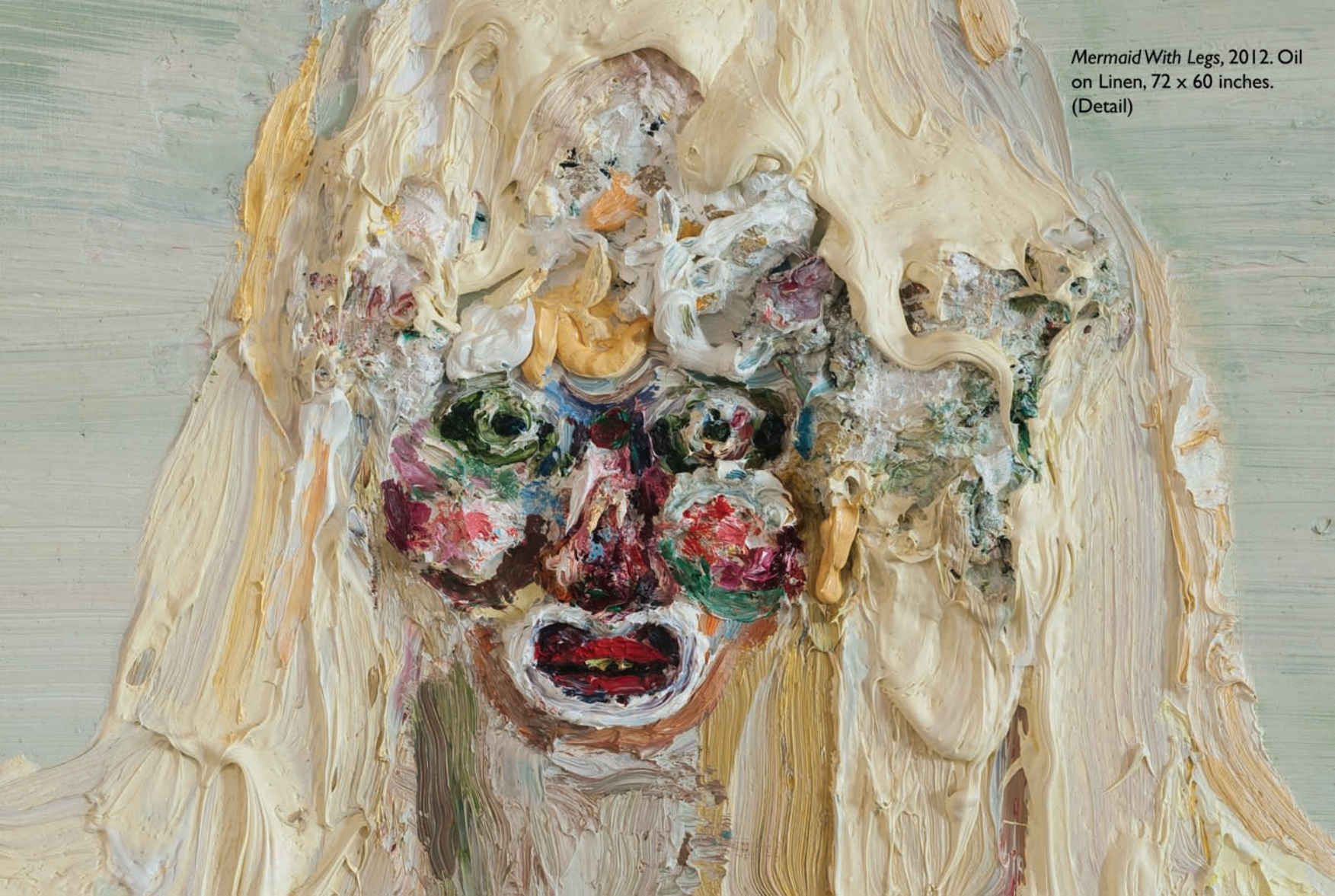
Mermaid With Legs , 2012. Oil on Linen, 72 x 60 inches. (Detail)