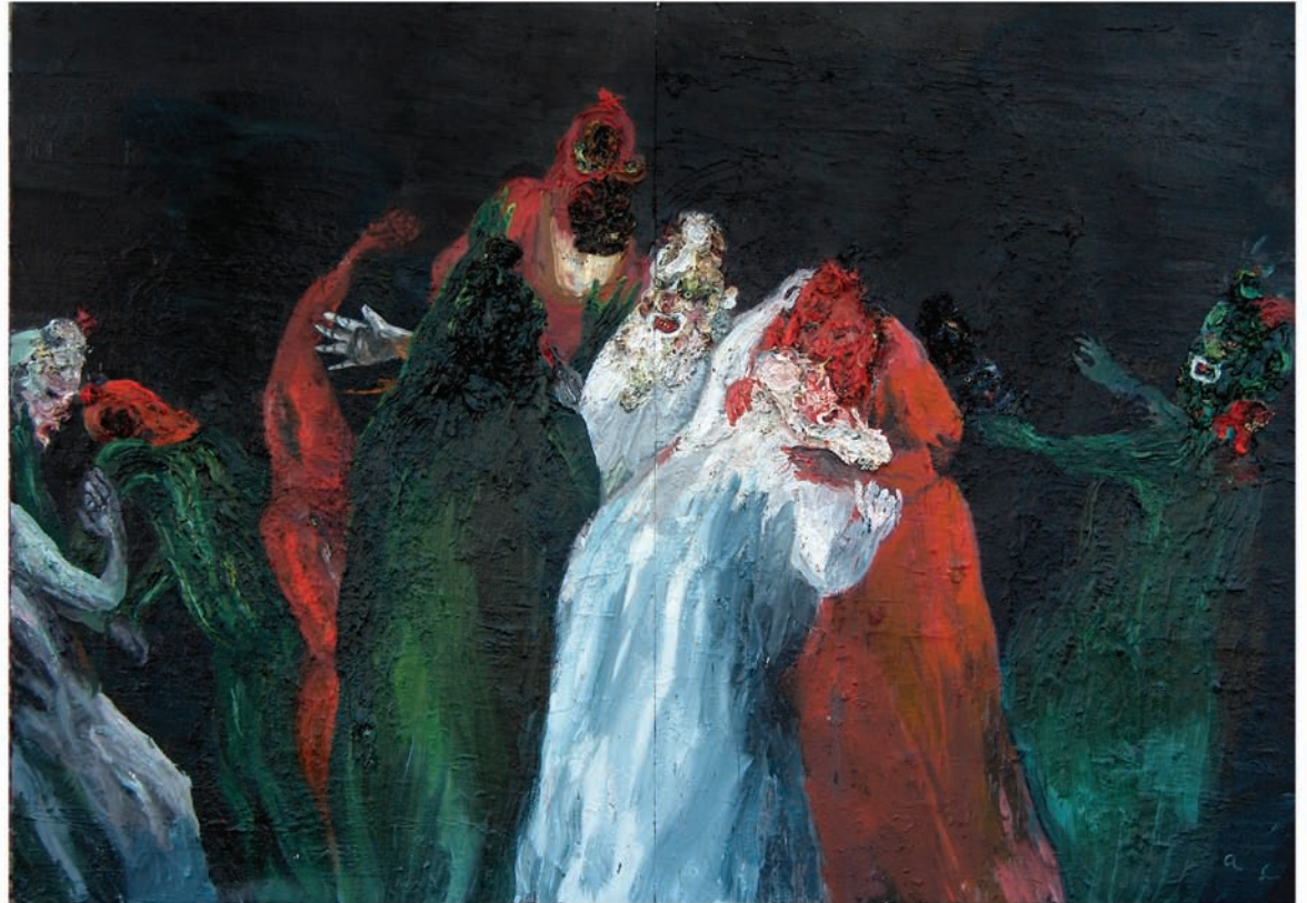
Performance , 2006. Oil on canvas, 96 x 136 inches Permanent Collection of the Laguna Art Museum

– Elizabeth Anderson-Kempe, Artillery Magazine , 2008