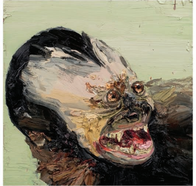
Left: Albino (Ape Woman #2) , 2006 (Detail). Oil on canvas, 60 x 72 inches Permanent Collection of the Museum of Contemporary Art, San Diego