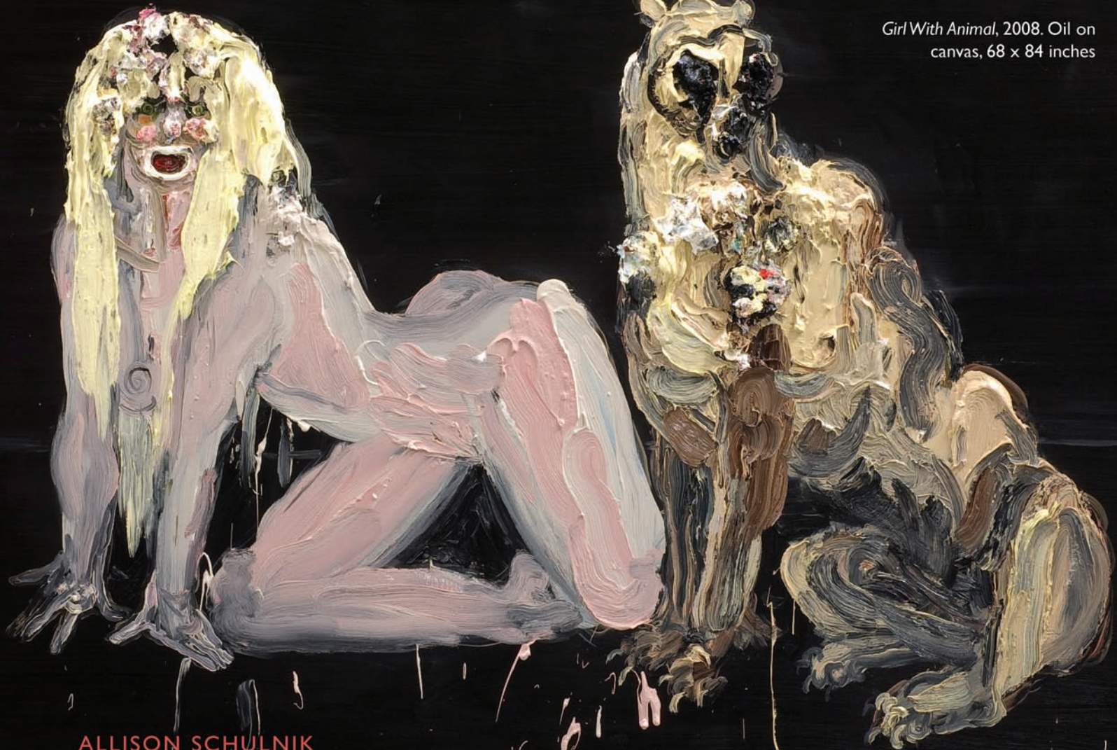
Girl With Animal , 2008. Oil on canvas, 68 x 84 inches