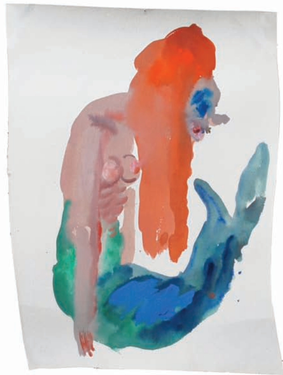
Left: Mermaid (Gouache) #1 , 2012. Gouache on paper, 16.25 x 10.75 inches Center: Sebastian (Gouache) #4 , 2012. Gouache on paper, 14.5 x 9.5 inches Right: Mermaid (Gouache) #2 , 2012. Gouache on paper, 16.25 x 12.25 inches