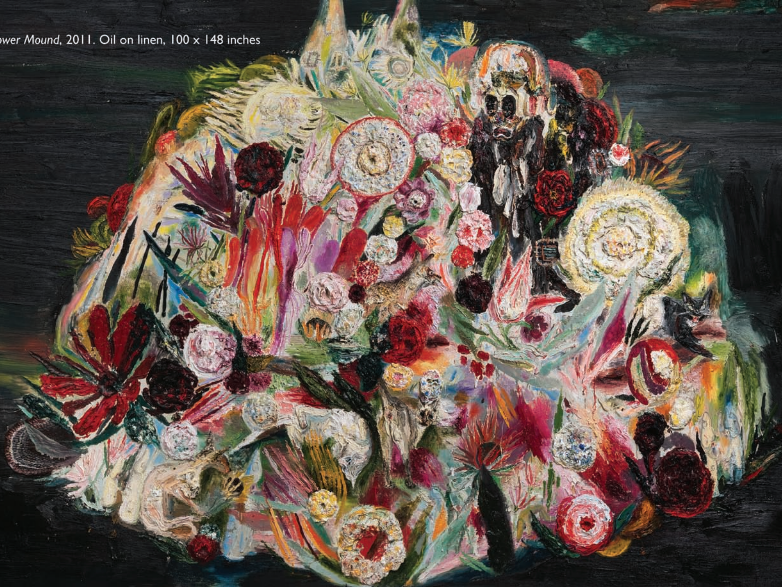
Flower Mound , 2011. Oil on linen, 100 x 148 inches