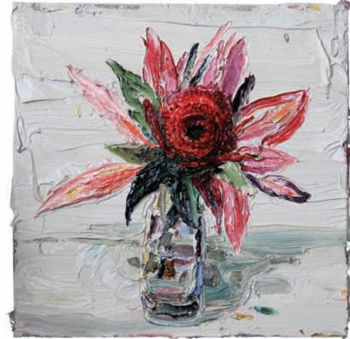
Above: Red Flower #2 , 2012. Oil on canvas stretched over board, 102 x 70 inches