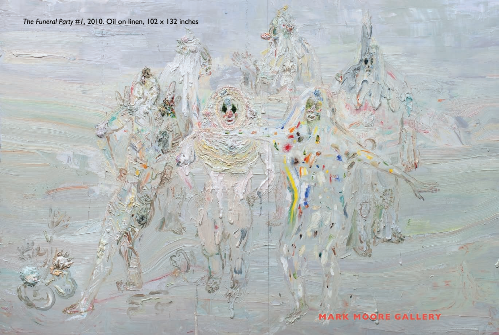
The Funeral Party #1 , 2010. Oil on linen, 102 x 132 inches