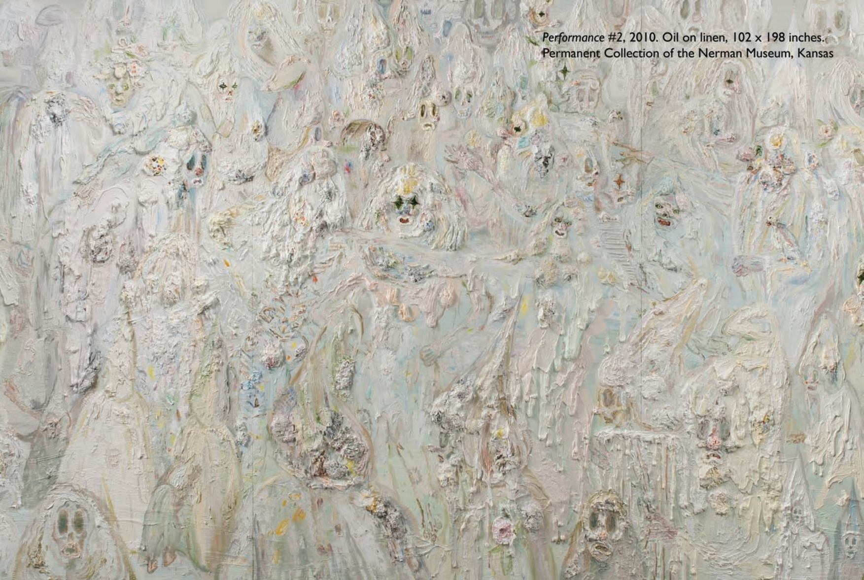
Performance #2, 2010. Oil on linen, 102 x 198 inches. Permanent Collection of the Nerman Museum, Kansas