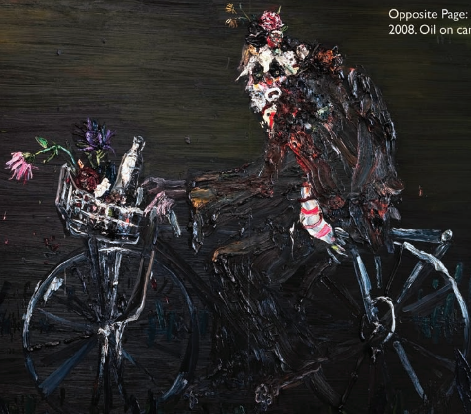
Opposite Page: Flowers for Long Hair Hobo #3 , 2008. Oil on canvas, 28 x 22 inches