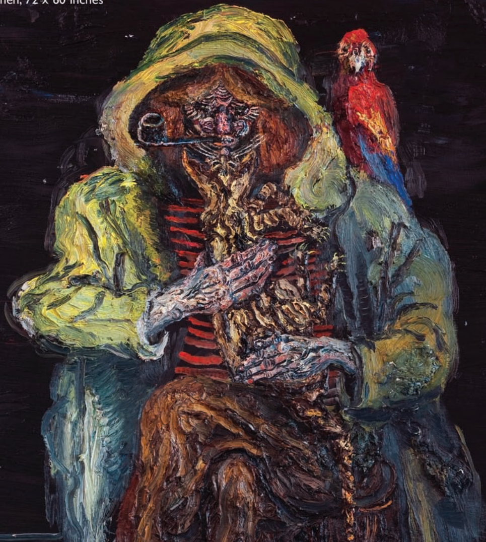
Sailor, 2012. Oil on linen, 72 x 60 inches