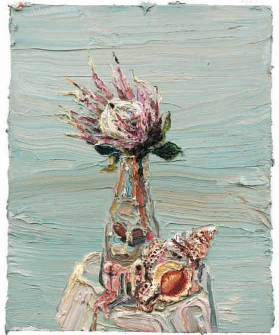
Above: Protea , 2012. Oil on canvas stretched over board, 30 x 24 inches.