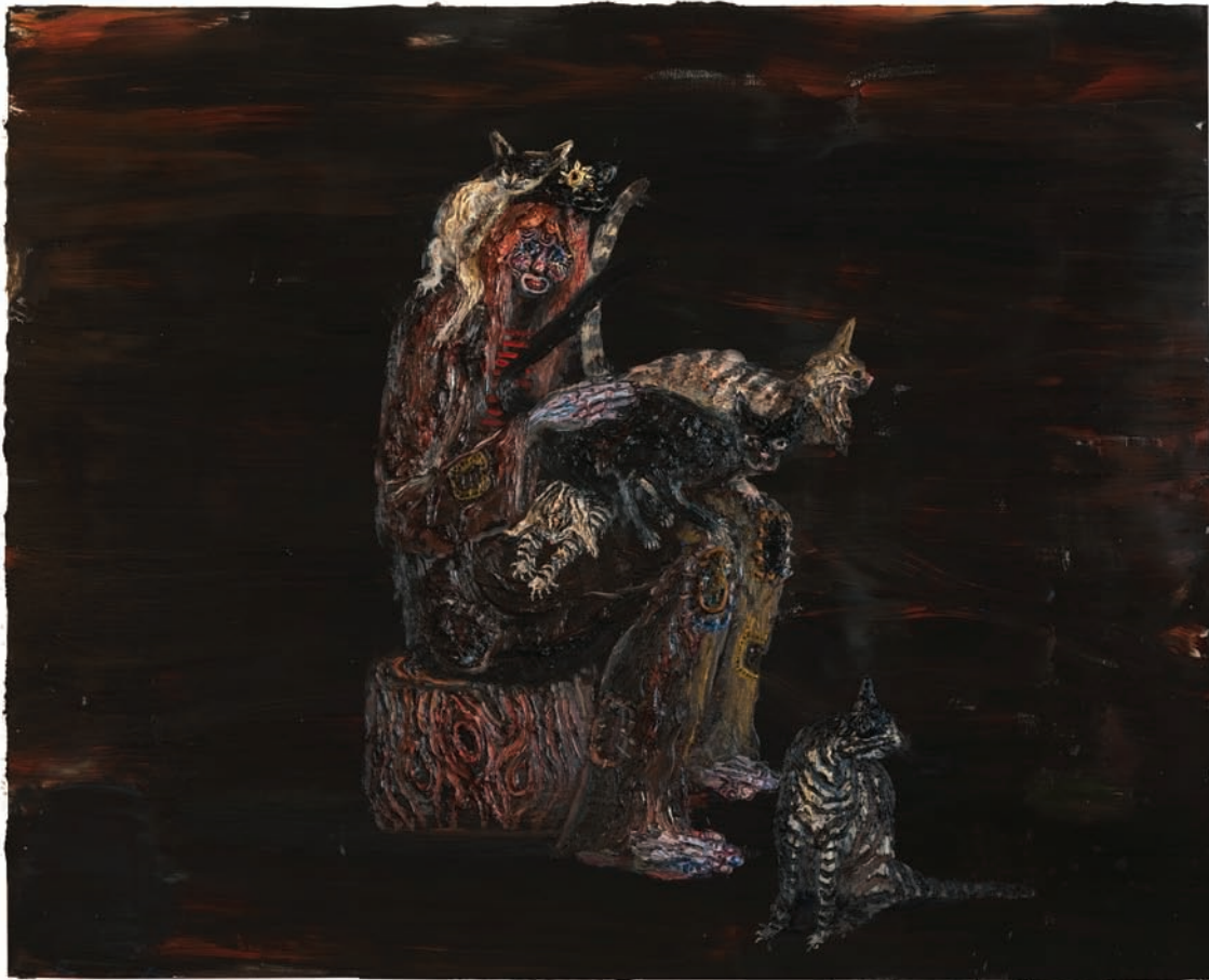
Captain , 2012. Oil on linen, 68 x 84 inches

"The exuberant Geek Love pulsates off the wall. A chaotic mix of fuchsia, red, black, light pink and bright blue, it depicts a closely jumbled collection of shapes and objects that seem to grow out of a red table-like surface. Thick pink, flower-shaped blobs of paint dominate the lower part of the painting. It's like a psychedelic dream featuring neon toys, the detritus of a long-ago childhood."