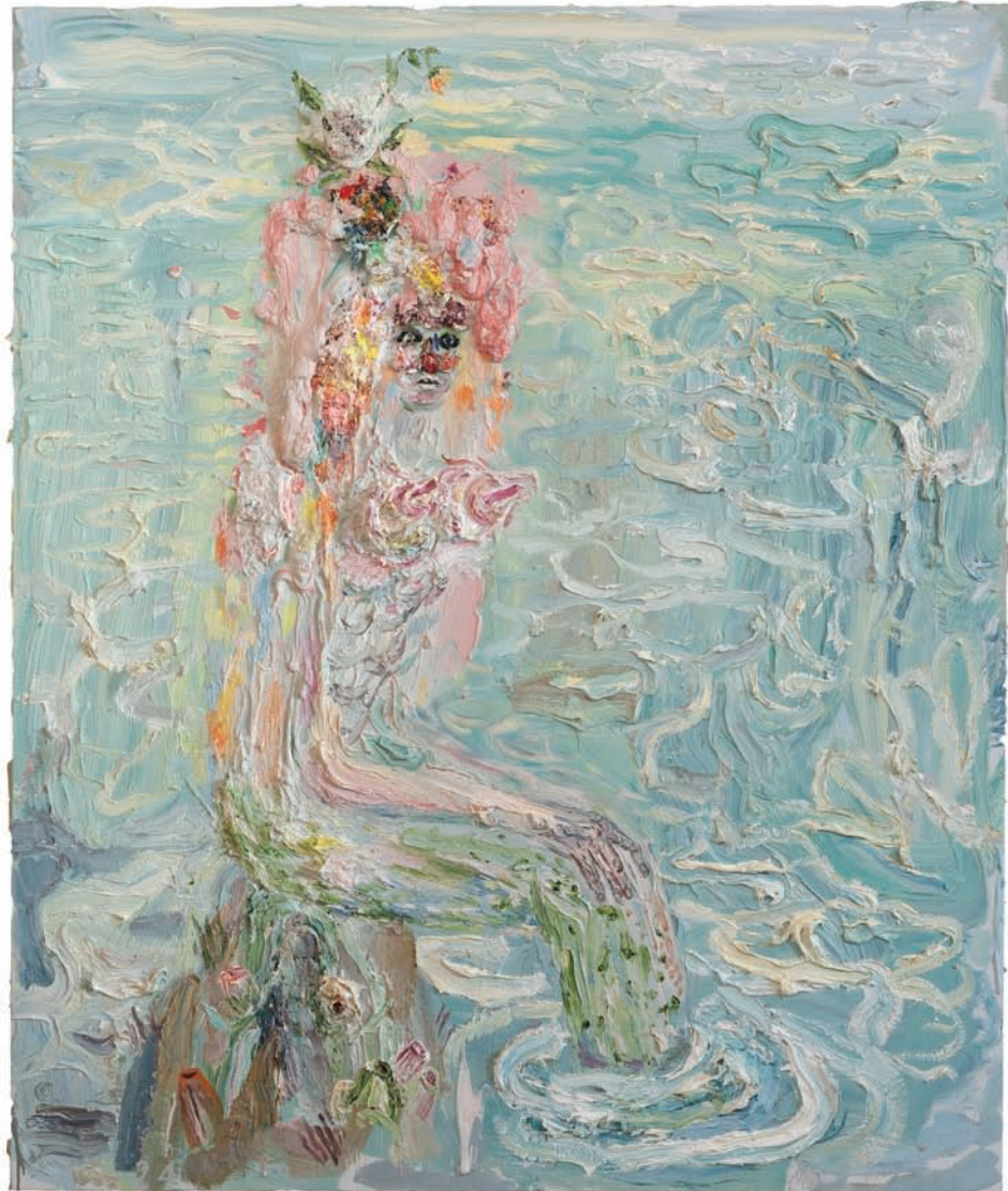
Right: Ariel , 2012. Oil on linen, 72 x 60 inches.