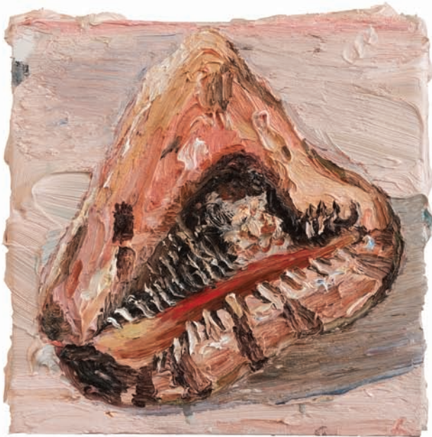
Above: King Helmet Shell , 2012. Oil on canvas stretched over board, 12 x 12 inches.