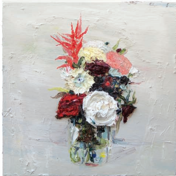
Above: Flowers For Visitor #3 , 2006. Oil on canvas, 20 x 20 inches