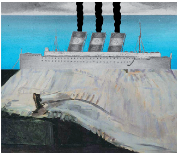
... AND MANET

In a classic format that recalls Baldessari's iconic "National City" paintings of the late 1960s, the appropriated imagery is reproduced in print and certain areas of each image have been repainted, deepening the interplay of gestures and media. By strategically cropping and juxtaposing found images, whether from publicity photographs, advertising or art history Baldessari questions the legitimacy of originality and the nature of authorship. The poignant and often humorous juxtaposition of images suggests relationships, narratives and threads that break down as quickly as they are pieced together.