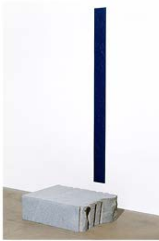
Giovanni Anselmo Paris October 23 – December 20, 2014