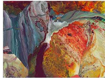
Gerhard Richter London October 14 – December 20, 2014