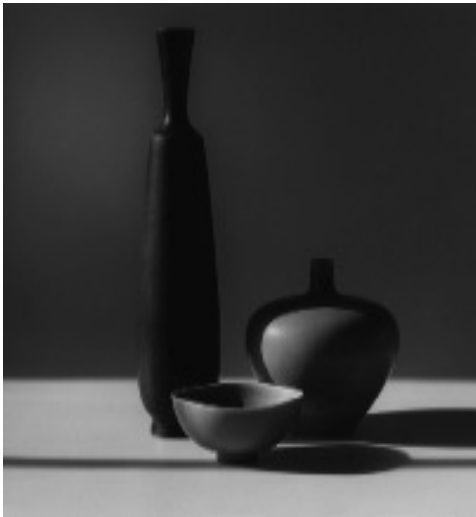
RM Glass Collection , 1984, 50,3 x 40,5 cm Impresión en gelatina de plata. Ed. 8/10 (*)