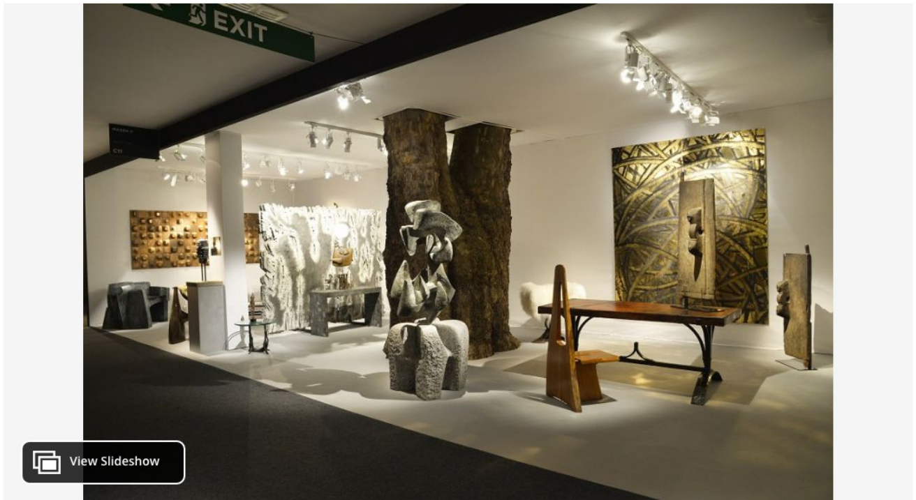
Magen H Gallery, PAD LONDON art fair, 2015.