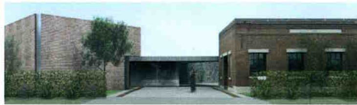
WHY ARCHITECTURE. Venice Gallery, external view.