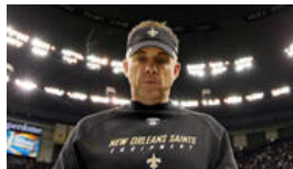
Dwyre: There are no winners in Saints' story