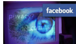
Can employers legally ask for Facebook passwords?