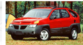
Photos: The 10 worst cars sold in America

Terms of Service | Privacy Policy | Los Angeles Times, 202 West 1st Street, Los Angeles, California, 90012 | Copyright 2012