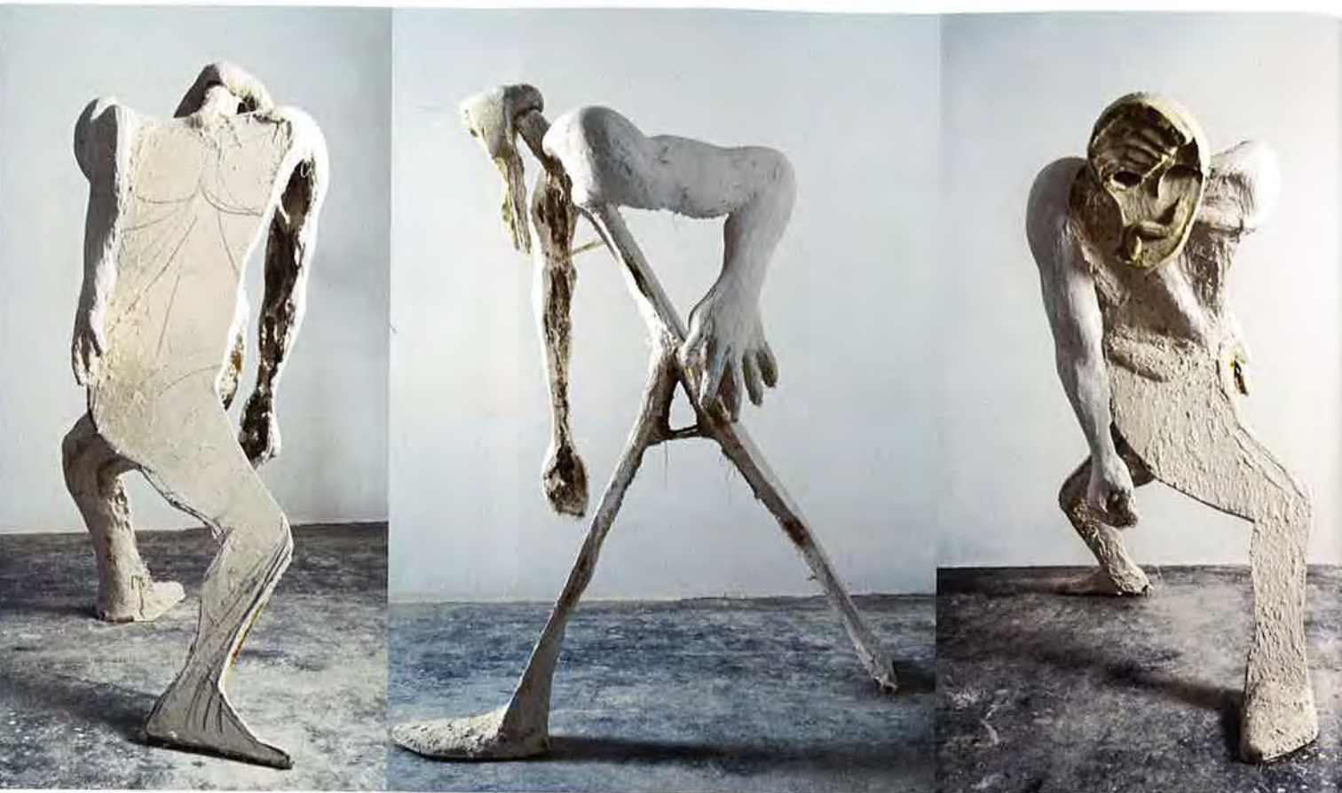
Striding Man , 2006. Tuff-cal, iron rebar, hemp, and graphite, 71 x 46 x 56 in. Three views.