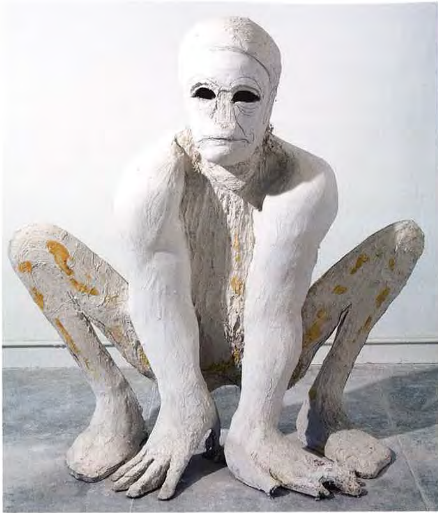
Above: Squatting Man , 2005. Tuf-cal, iron rebar, hemp, wood, and graphite, 60 x 56 x 30 in. Right: Bottle Head , 2010. Tuf-cal, hemp, and iron rebar, 77 x 39 x 37 in.