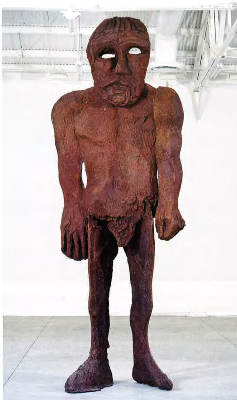
Untitled (Red Man), 2009. Bronze, 156 x 60 x 48 in.

RRL: Your sculptures often show evidence of their making, such as exposed rebar and visible structural components.