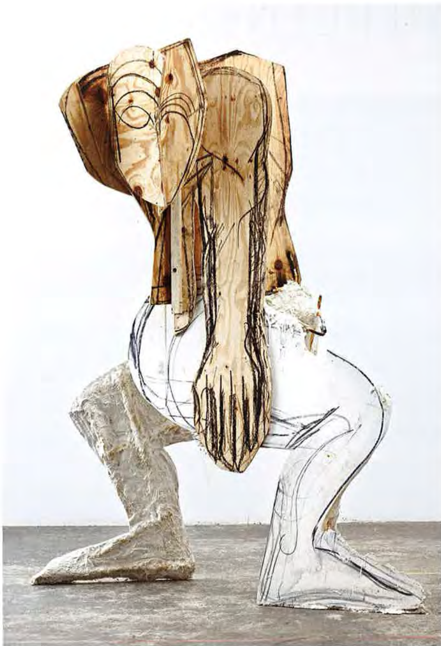
Serpent, 2008. Tuf-cal, hemp, iron rebar, oilbar, graphite, and wood, 96.1 x 61 x 47.25 in.

TH: I am not afraid of trying to give a work a powerful energy. I believe that art can be powerful without being bombastic or macho, and not everything has to end up being ironic. But I am wary of a kind of human social power that dictates while denying doubt and weakness. Often I find that my biggest, most seemingly intimidating works are the most ludicrous and fragile, but I don’t really push that. My experience growing up has made me deeply suspicious of social power structures and the idea of a dominating, impenetrable male power. I’ve always loved the Dylan lyric, “Even the president of the United States must sometimes have to stand naked.”