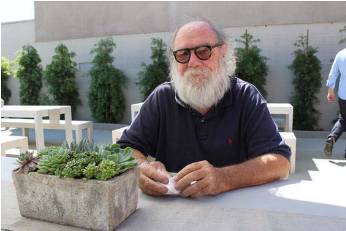
Artist Paul McCarthy

New York heavy-hitter L&M Arts has expanded its reach to Los Angeles with a new location in Venice. The new space on Venice Boulevard (formerly the site of Ray Bradbury's home), opened September 25 and features three sculptures by contemporary L.A. artist Paul McCarthy. In a tribute to hedonism, the drive of human nature and Disneyland's Pirates of the Caribbean, McCarthy presents probably your only chance to witness aural copulation between swine; his large-scale installation "Train, Mechanical" features two robotic figures riding silicon pigs with a smaller piglet penetrating the ear of its heftier counterpart. The gallery will feature a combination of post-war and contemporary art. Exhibition runs through November 6. All photos by Deidre Crawford.