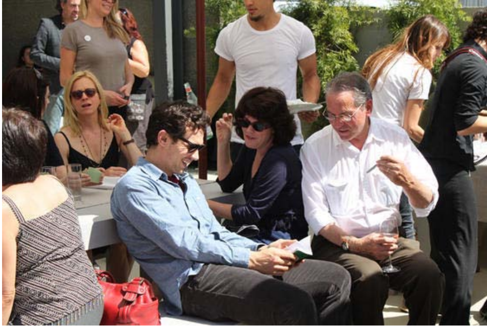
James Franco