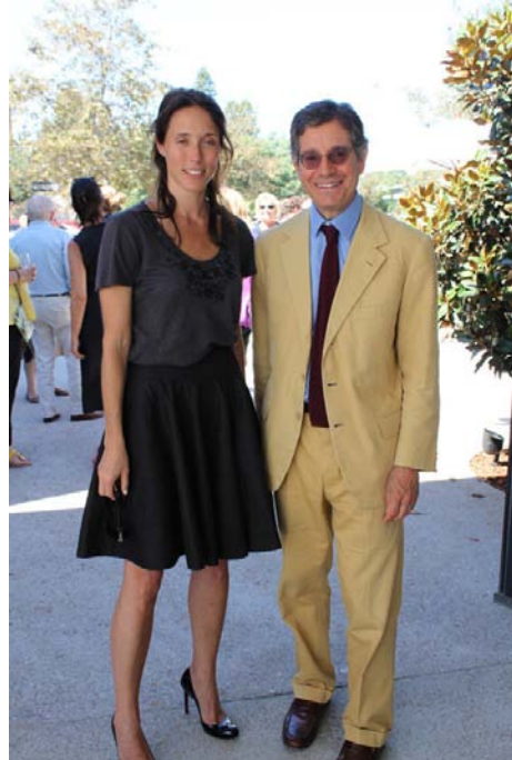
Jeffrey Deitch, Director of MOCA