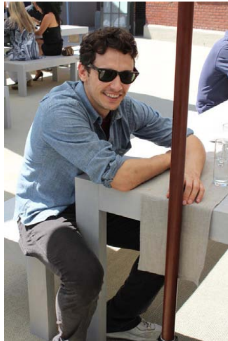
James Franco