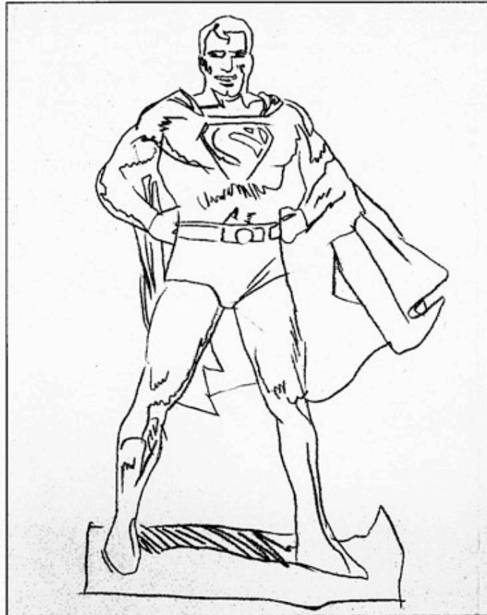
Untitled (Superman from Myths) , 1981, graphite on HMP paper, 40 1/4 x 30 3/8 inches.

If portraiture is traditionally defined as reproducing a recognizable likeness of the subject, then a great portion of Andy Warhol's work can be considered portraits. While Warhol's portraiture has been addressed in shows focusing on drawings or paintings, this show at the Kantor Gallery has a wider scope. This is an exhibit where the breadth of Warhol's portrait work will be explored. Here the treatment of his commissioned portraits will be available for comparison to his por-