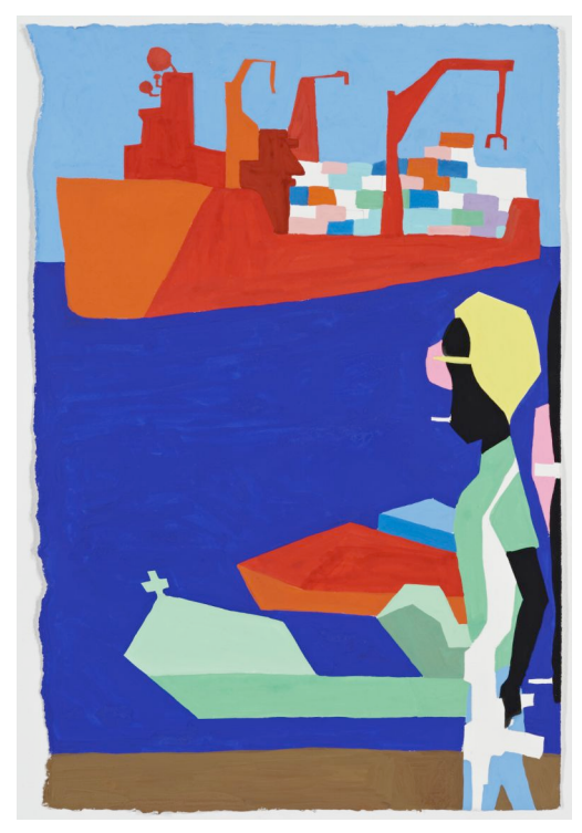
TODD JAMES, Red Tanker, 2010, Gouache & graphite on paper, 22 1/2 x 15 inches, Image courtesy of Gering & López Gallery, New York.