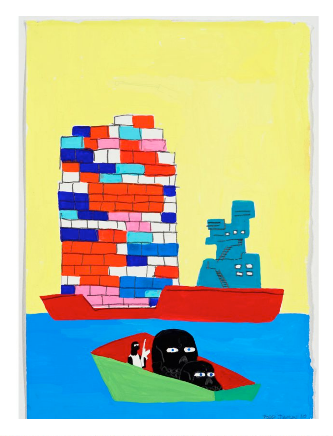
TODD JAMES, Somali Cargo, 2010, Gouache & graphite on paper, 15 1/2 x 11 inches, Image courtesy of Gering & López Gallery, New York.