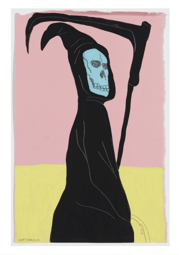
TODD JAMES, The Green Reefer, 2010, Gouache & graphite on paper, 15 1/2 x 10 inches, Image courtesy of Gering & López Gallery, New York.