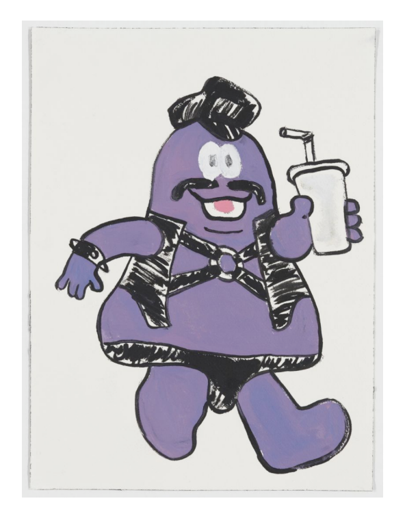
TODD JAMES, Leather Boy Grimace, 2010, Gouache, graphite & marker on paper, 12 1/4 x 9 inches, Image courtesy of Gering & López Gallery, New York.