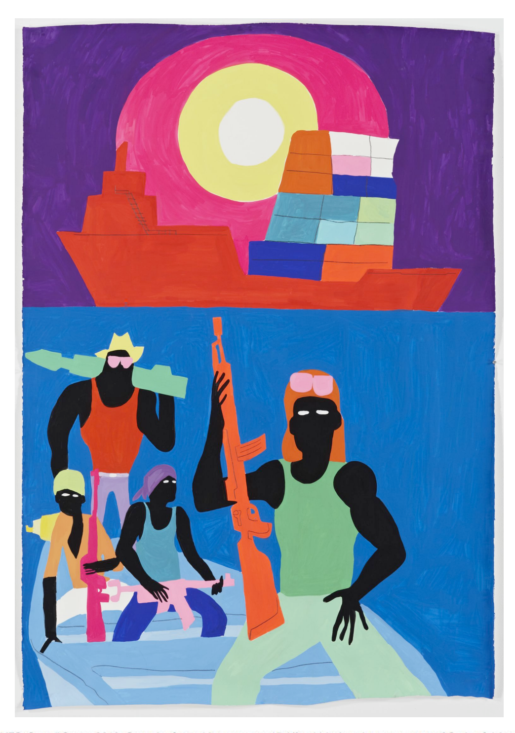
TODD JAMES, Somali Cargo, 2010, Gouache & graphite on paper, 15 1/2 x 11 inches, Image courtesy of Gering & López Gallery, New York.