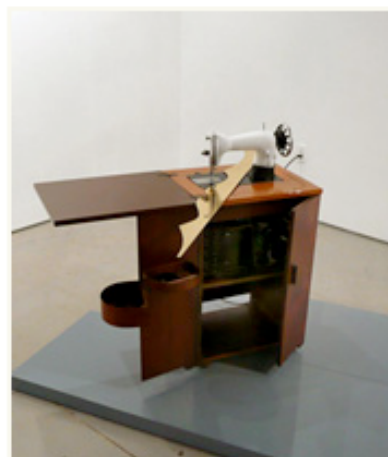
Jane Simpson A Wolf in Sheep's Clothing 2008 Gering & López Gallery

The high design of Simon's work is very much in line with the sensibility animating the 2008 Whitney Biennial, which is about décor more than anything else. Everything in the show is shiny or polychromed or naturalistically textured, impeccably laid out and neatly aligned; even the art that resembles construction detritus is arranged like a Zen garden.