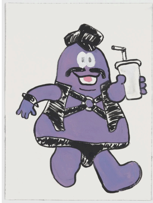
TODD JAMES, Leather Boy Gimace , 2010, Gouache, graphite & marker on paper, 12 1/4 x 9 inches, Image courtesy of Gering & López Gallery, New York.