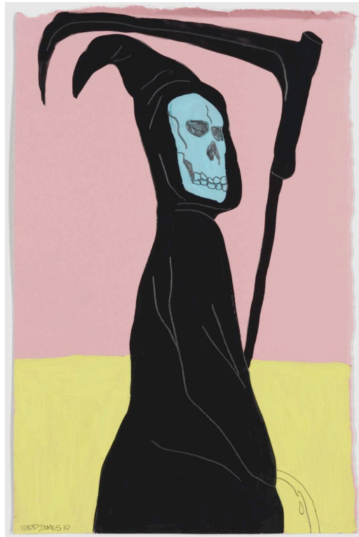
TODD JAMES, The Green Reefer , 2010, Gouache & graphite on paper, 15 1/2 x 10 inches, Image courtesy of Gering & López Gallery, New York.