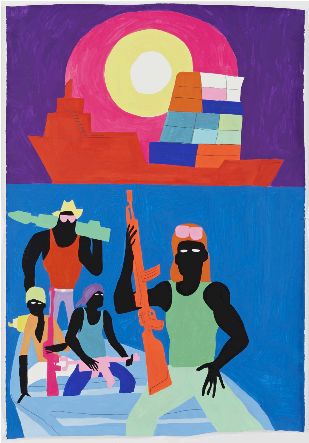
TODD JAMES, Somali Cargo , 2010, Gouache & graphite on paper, 15 1/2 x 11 inches, Image courtesy of Gering & López Gallery, New York.