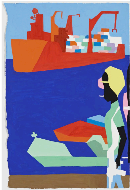
TODD JAMES, Red Tanker , 2010, Gouache & graphite on paper, 22 1/2 x 15 inches, Image courtesy of Gering & López Gallery, New York.

730 FIFTH AVENUE NEW YORK NY 10019 TEL 646 336 7183 FAX 646 336 7185 WWW.GERINGLOPEZ.COM