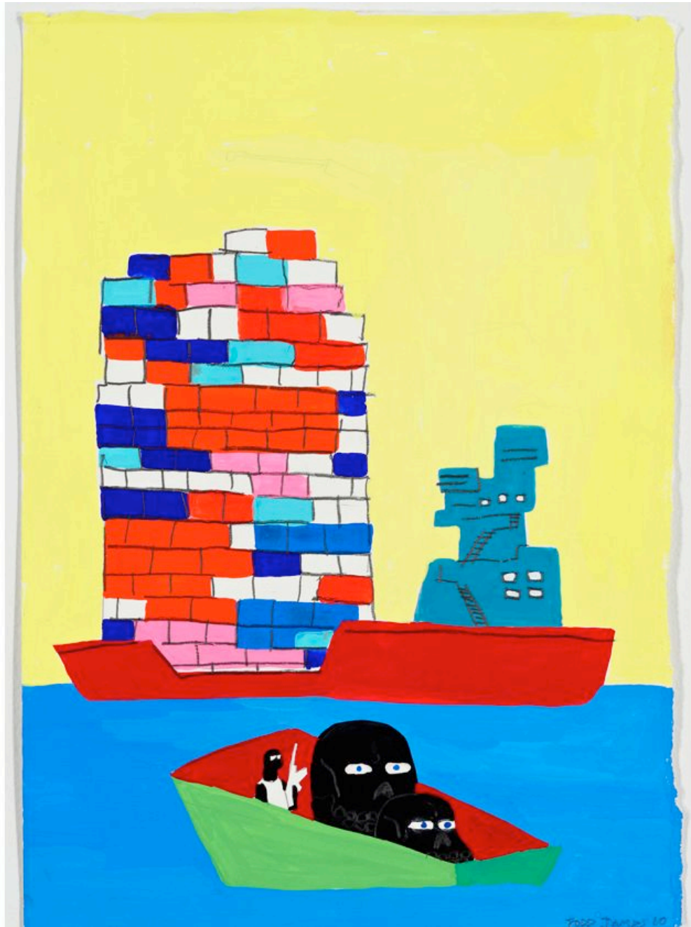
TODD JAMES, Somali Cargo , 2010, Gouache & graphite on paper, 15 1/2 x 11 inches, Image courtesy of Gering & López Gallery, New York.