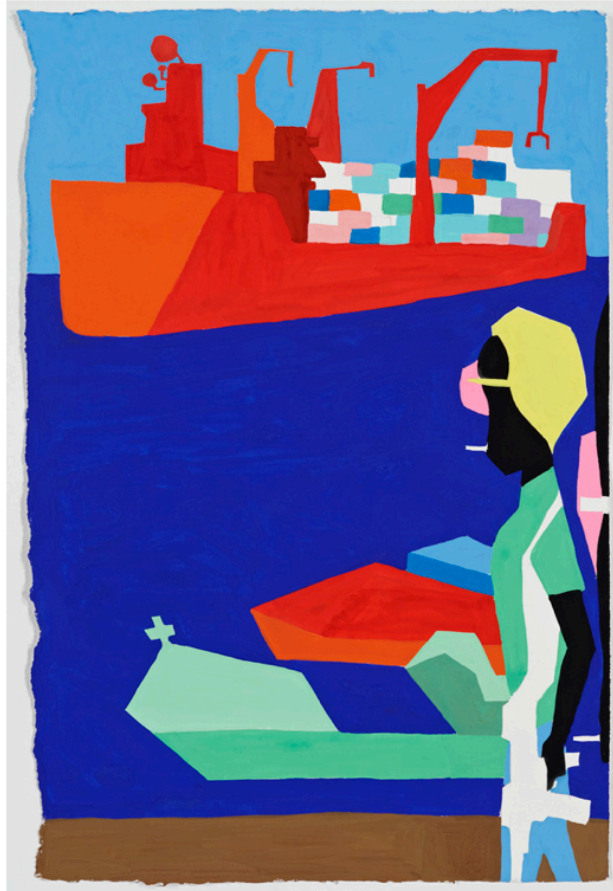
TODD JAMES, Red Tanker , 2010, Gouache & graphite on paper, 22 1/2 x 15 inches, Image courtesy of Gering & Lopez Gallery, New York.