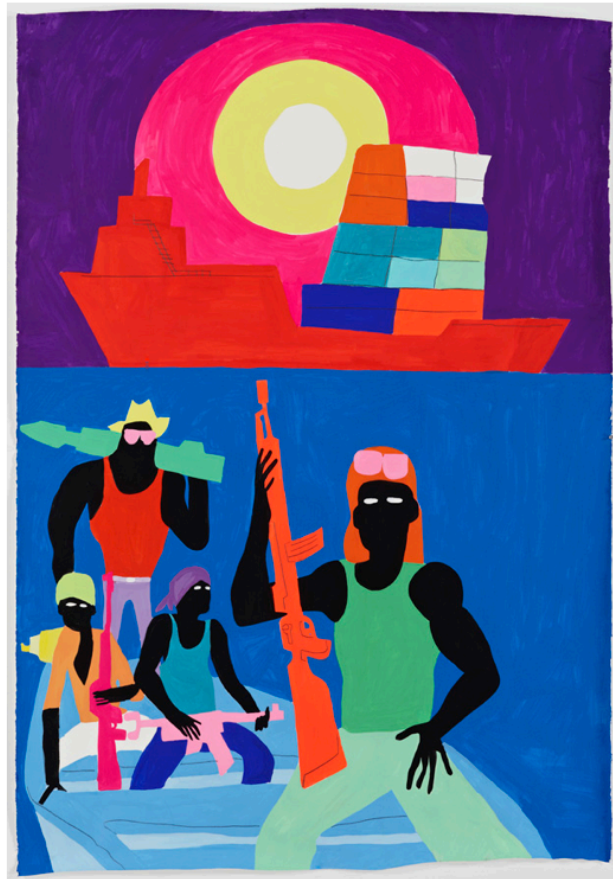
TODD JAMES, Somali Pirates at Sun Down , 2010, Gouache & graphite on paper, 74 1/2 x 51 1/2 inches, Image courtesy of Gering & Lopez Gallery, New York.