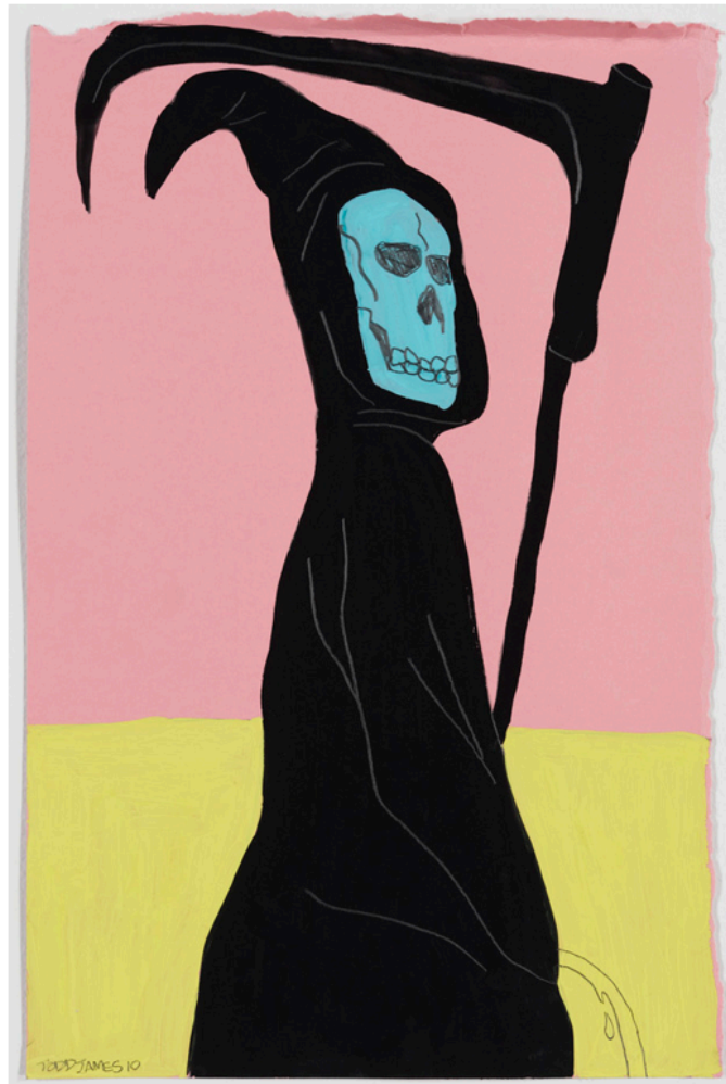
TODD JAMES, The Green Reefer , 2010, Gouache & graphite on paper, 15 1/2 x 10 inches, Image courtesy of Gering & López Gallery, New York.

Gering & López Gallery 730 Fifth Avenue Between 56th and 57th Streets New York, NY 10019 tel: 646 336 7183