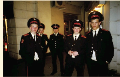
Cadets of the Suvorov Academy, Moscow, 2000

Museo del Prado P o del Prado, s/n (Metro: Atocha). Tel: 91 330 28 00. Tues-Sun 9am-8pm. 8, Tues-Sat 6-8pm, Sun 5-8pm. Free. 23 Mar-30 May. Richard Hamilton: Picasso's Meninas How to capture the same sense of cavernous space as Velázquez did in his trippy play on perspective, Las Meninas , has fired the imagination of many an artist. Goya had a stab at it in 1778, as did Picasso in 1957. And in 1973 Richard Hamilton had a brainwave. With more than a nod to Picasso, the London-born Pop artist gave the portrait a Cubist overhaul. Judge for yourself who pulled it off best at this Prado show featuring all three efforts.