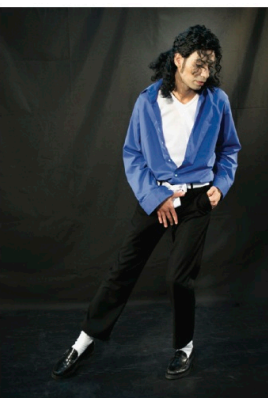
Forever: King of Pop

Accidental de un Anarquista and Alizia 21 , an updated, adults-only version of Alice in Wonderland. And if you're looking to learn a bit about the history of Spanish drama, there's a production of Tirso de Molina's original La Celosa de Sí Misma performed by A Priori and Teatro de Malta; Basta que me Escuchen las Estrellas , put on by Madrid's Micomición, addresses the life of Lope de Vega; and Ribalto Producciones from Murcia offers Clasicorro lo Serás Tú , which touches on the lives of Golden Age playwrights Lope, Tirso and Pedro Calderón de la Barca. Teatro Fernando de Roja (Círculo de Bellas Artes), C/Marqués de Casa Riera, 2 (Metro: Banco de España/Sevilla). Tickets (entradas.com) 12-15. Until 22 Mar. For show times and dates visit: www.circulobellasartes.com/ag_escenicas.php.