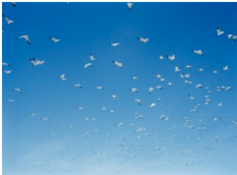
Birds at the Landfill in New Jersey, 2012