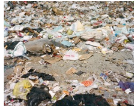
Thank You For Shopping, 2012, Chromogenic Print

"The sweet singing of garbage trucks constantly working every night, the intense squealing of rats enjoying a good leftover meal, the colors of flying plastic bags in a super noisy New York City street, are just some of the inspirations that I collect to create my paintings and pictures."