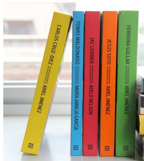
R: Sample page from eBook for Carlos Cruz-Diez in conversation with/en conversación con Ariel Jiménez . L: The five CONVERSACIONES/CONVERSATIONS books published by FC/CPPC.