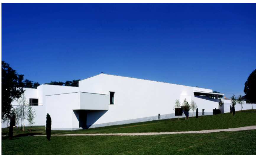
A view of the Serralves Museum of Contemporary Art Designed by Pritzker Prize winning Portuguese architect Álvaro Siza Vieira

WITH A FUNDRAISING DINNER SERRALVES WILL HONOR THE 25 TH ANNIVERSARY OF THE FOUNDATION & THE 15 TH ANNIVERSARY OF THE SERRALVES MUSEUM OF CONTEMPORARY ART