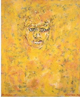
Beauford Delaney's 'Portrait of Ella Fitzgerald' (1968) paired with a gold Mainbocher brocade gown.