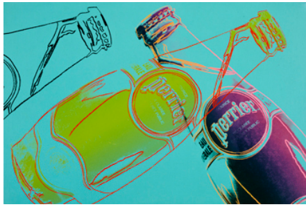
Andy Warhol, Perrier 1983, Synthetic polymer paint and silkscreen ink on canvas, 30 x 20 inches