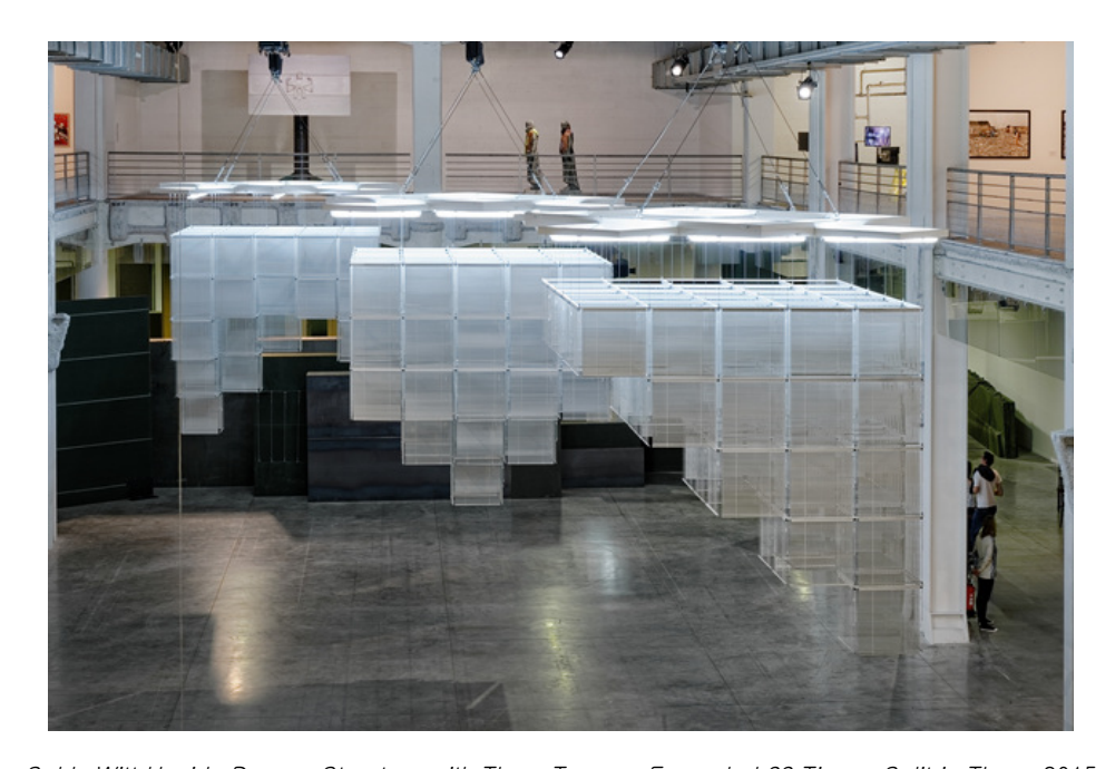
Sol LeWitt Upside Down - Structure with Three Towers, Expanded 23 Times, Split in Three, 2015 Aluminum Venetian blinds, aluminum hanging structure, powder coating, steel wire, fluorescent tubes, cable 3 towers, 438 x 426 x 426 cm each

Website: https://www.artbasel.com/basel/the-show