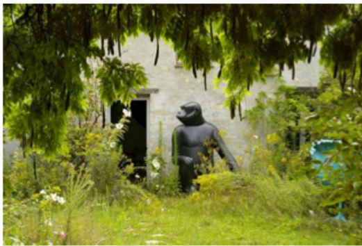
LES LALANNE 293 Tenth Avenue and 515 W. 27th Street May 4-June 9