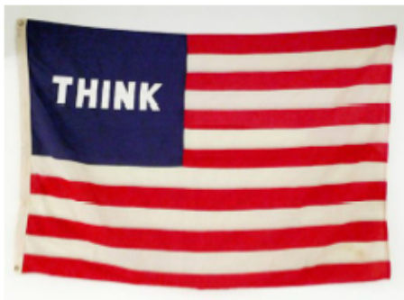
WILLIAM COPLEY 293 Tenth Avenue October 2012