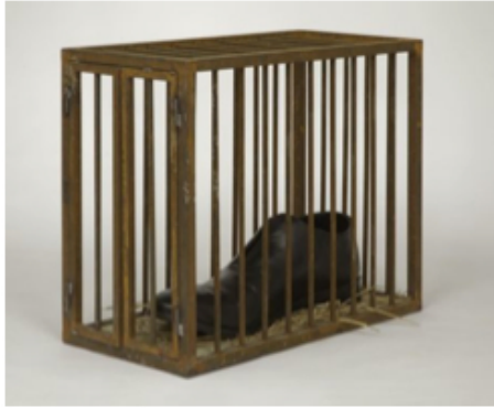
SAINT CLAIR CEMIN 515 W. 27th Street September 2012

For his first solo exhibition at the gallery, the Brazilian-born sculptor Saint Clair Cemin will present six new large-scale figurative and abstract sculptures. Crossing folk art with classical and High Modernist forms, Cemin's sculptures, in polished stainless steel and traditional black-lacquered resin, convey the complexities of surface and movement.