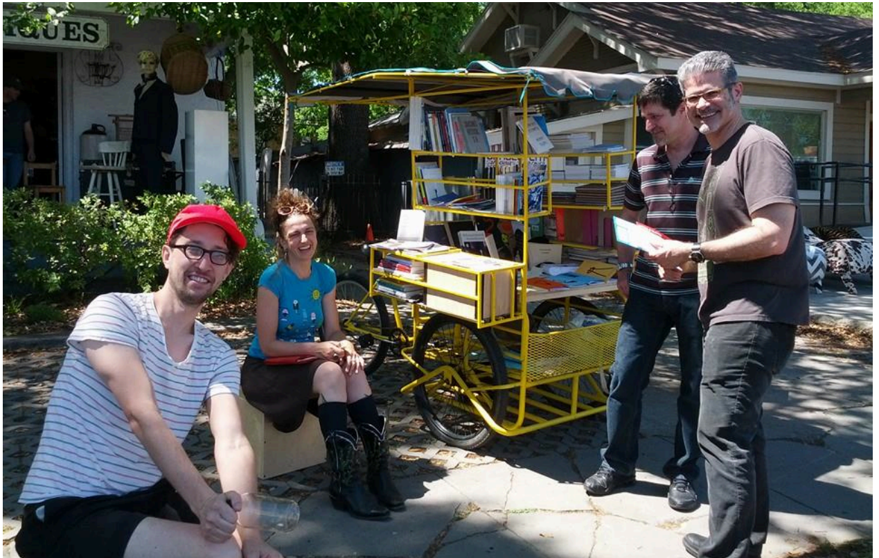
The AntenaMóvil, a converted Mexican cargo trike turned bookmobile at Sunday Streets.

New York, NY (August 23, 2016) – Today the Robert Rauschenberg Foundation announced the twelve recipients of its 2016 SEED grants. Houston-based arts organizations Alabama Song and Antena were selected for their pioneering work and their appetite for risk.