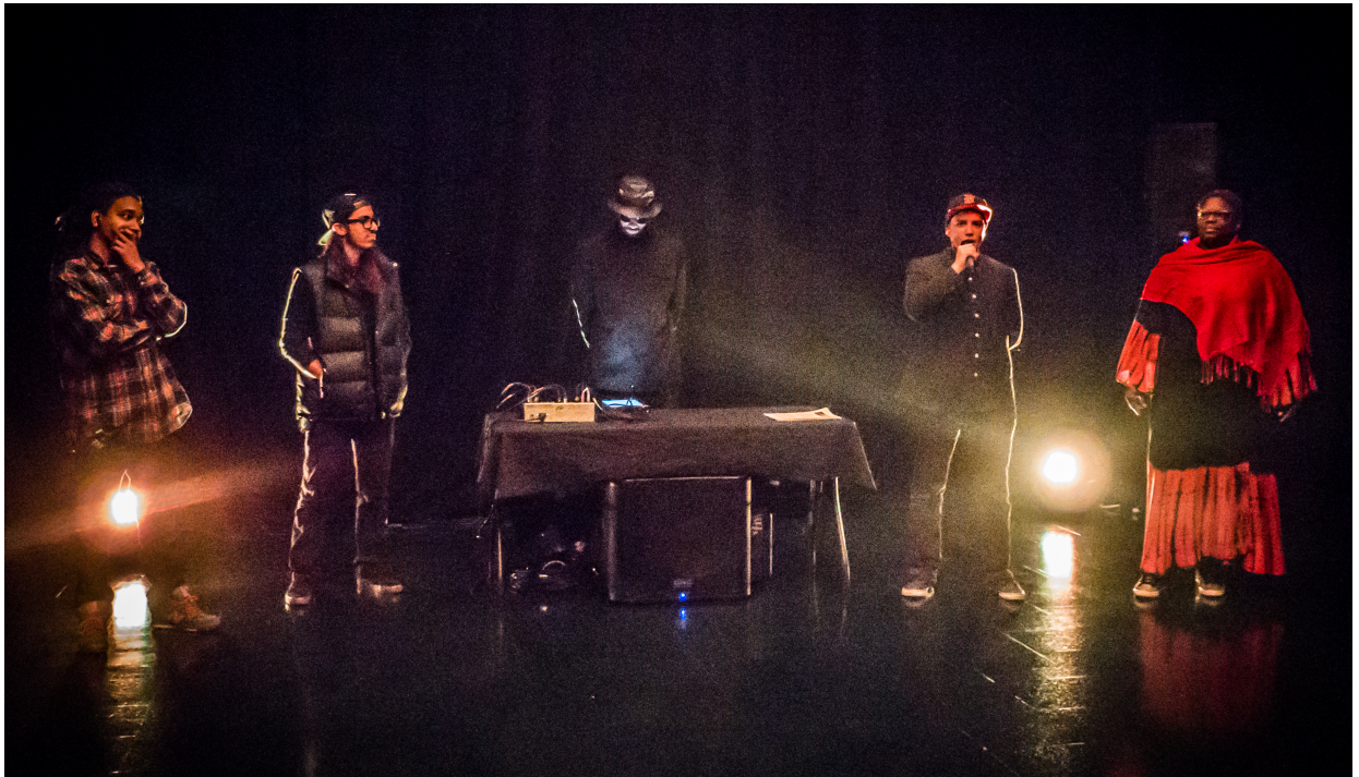
A Complex Movements workshop with social justice youth organizers in Detroit.

New York, NY (August 23, 2016) – Today the Robert Rauschenberg Foundation announced the recipients of its 2016 SEED grants. Detroit-based arts organizations Complex Movements and Fringe Society Studio were selected for their pioneering work and their appetite for risk.