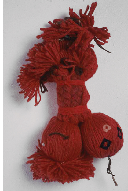
Left: Jeff Koons, Stacked , 1988, polychrome wood, 61 x 53 x 31 inches. Edition of 3 + 1 AP. Right: Mike Kelley, Manly Craft #4 , 1989, yarn animals, tied (octopus doll), 14 x 9 x 4 inches.