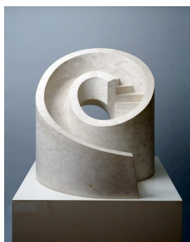
Isamu Noguchi, Slide Mantra , model, botticino marble, c. 1985