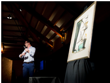
The Annual Art Auction features over 200 works of art up for bid in live and silent auctions