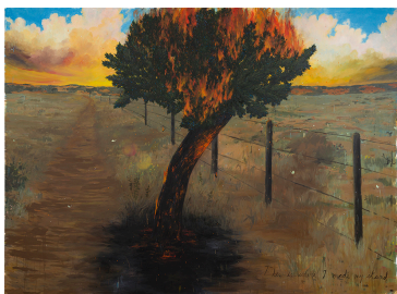
The Sigh, 2015 Oil and wax on canvas 132 x 180 in.