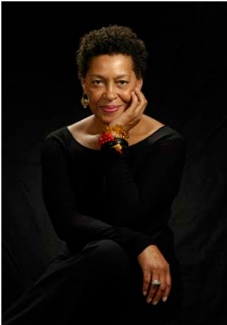
Carrie Mae Weems

20 th Annual Gala Celebration Will Take Place July 21, 2016 2016 Marks the 50 th Anniversary of Anderson Ranch Arts Center